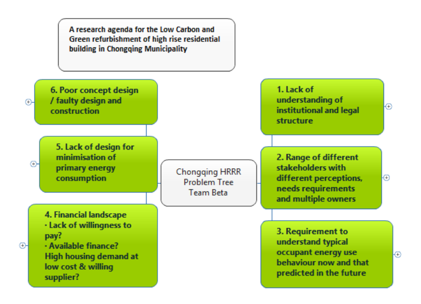
Figure 2 – An example of the top level of the problem tree produced by one of the groups