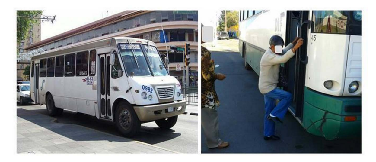
Fig 3 The buses were built on converted truck chassis

Due to buses being built on truck chassis, they all had high passenger platforms, no ability to lower the floor of the bus, and manual transmission. The handrails were generally placed horizontally on both sides of the gangway at a height of approximately of 175 centimetres. There were vertical handrails only near to the front and rear door. Most of the buses had a single bell placed on the vertical handrail close to the rear door at a height of approximately of 170 centimetres. The buses were designed so that passengers boarded at the front door and exited through the rear.