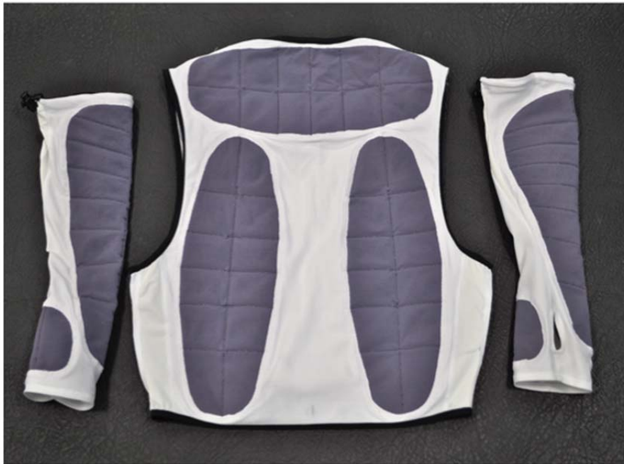
Figure 1: The cooling vest and sleeve ensemble. The vest and sleeves consisted of a breathable mesh body, with hydrophilic silica gel packs (blue regions) that became saturated following water immersion. A) Anterior aspect, B) Posterior aspect. Temperature was manipulated after saturation via cold-water immersion with subsequent storage in a refrigerator (COOL) or a freezer (COLD)