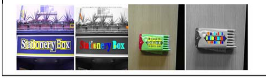
Figure 5: Non-text regions are removed using SVM classifier learnt from the combination of features, b: candidate characters bounded by boxes