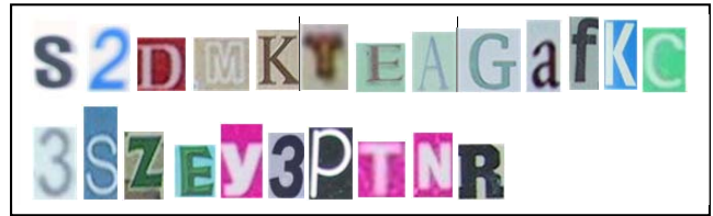
Figure 2: Examples of text samples in the ICDAR dataset

The ICDAR 2003 dataset (Lucas, S.M. et al 2003)( Lucas, S. M. , et al 2005) has been widely used as a benchmark for researchers in the field of text detection. There are 509 completely annotated text images included in this dataset. 251 of these images are employed in testing and 258 are for training. The texts in this database vary greatly in fonts, sizes, styles and appearance. The dataset provides targets with the images, which are the ground truth locations for text that are available in the images. The target used to calculate a precise evaluation of the results of text detection techniques where the text detection methods provide estimates, which is a form of a rectangle that bound a text area in the image (Lucas, S.M. et al 2003; Lucas, S.M. et al 2005; Mosleh, A., et al 2012). In the training phase, 7423 regions have been extracted from ICDAR 2003 dataset to train and test different descriptors. 6353 positive patches and 1070 negative patches randomly sampled from training set of ICDAR 2003 dataset. Figures 2,3 show examples of text non-text regions respectively.