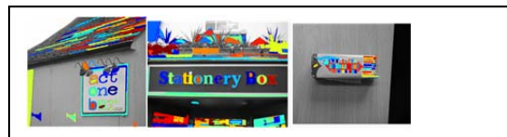
Figure 4 : The result of using MSER detector

The goal of the proposed method is to detect as many text components as possible and it is difficult or impossible to recover the missed characters in the following steps. This lead to set the threshold of MSERs to its lowest value 1 which made it possible to capture most challenging cases. For each image in testing phase the first step of the text detection module is to extract Maximally Stable Extremal Regions (MSER) in order to obtain text-region candidates. The MSER algorithm depends only on the intensity of the image. Since the text in the image tends to have equal intensity, that means the output of this step are candidate regions containing at least one symbol. Figure (4) shows the result of detecting MSER regions. It shows clearly that the MSER algorithm detects many false positives – regions (non-text). The classification model has been used to classify candidate regions to text and non text regains. Where the best descriptors and best classifier which are determined in training phase have been used (the combination of all features (HOG+lbp+GLSM+AR with SVM). All regions that are classified as non-text regions by the MSER are removed from the scene image. MSER regions that are classified as text are then mapped onto the image and bounded by boxes. The pixels inside these bounding boxes are marked as text pixels, as shown in Figure (5).