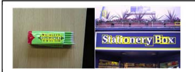
Figure 6: Results of expanded bounding boxes of texts

The character grouping module joins the detected characters into text regions – which may be words or text lines. This step is important to enable recognition of the actual words in an image, providing more meaningful information than just individual characters. It is also an essential step when using Optical character recognition (OCR) to recognize the words in largely connected text regions. One approach for merging individual text regions into words or text lines is to first find neighboring text regions and then form a bounding box around these regions. To find neighboring regions, the bounding boxes computed earlier, which are the result of the MSER regions classification to text and non_text, are expanded. This makes the bounding boxes of neighboring text regions overlap such that text regions that are part of the same word or text line form a chain of overlapping bounding boxes Figure (6).