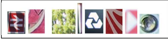
Figure 3: Examples of non-text regions

For all descriptors, the features were set as the positive samples represented by 1 in the classifier. Features were set as the negative samples, represented by 0 in the classifier. For this purpose, we use a classifier based on SVM with linear kernel, Multilayer Perceptron MLP, Random Forest RF.