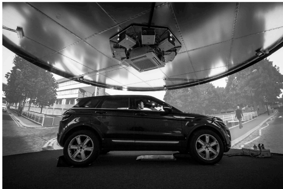
Fig. 2. 3xD with LiDAR scanned imagery displayed.