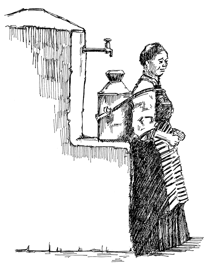
Figure 4. 'Back happy' tapstand in Tibet

At the household level there are a limited number of users, most of whom are known and whose current needs can be identified and near-future needs largely foreseen (e.g. ageing, pregnancy, illness). This scenario requires a basic user-friendly design and a range of accessibility features to choose from. The basic design should provide adequate floor space and minimum entrance width – these features benefit everyone and are