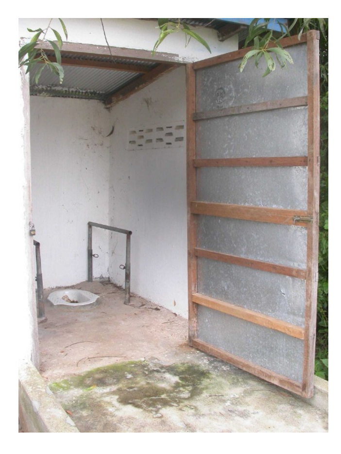
Figure 3. Latrine with handrails and wide door

Water and sanitation for all in low-income countries Jones, Fisher and Reed