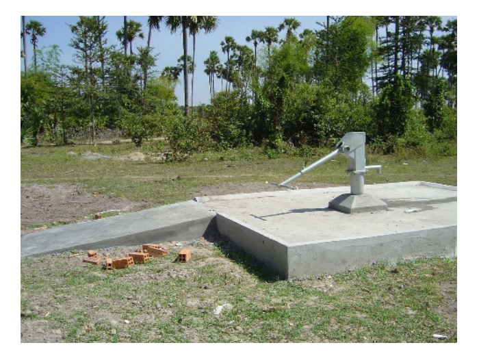
Figure 2. Handpump platform with ramp in Cambodia