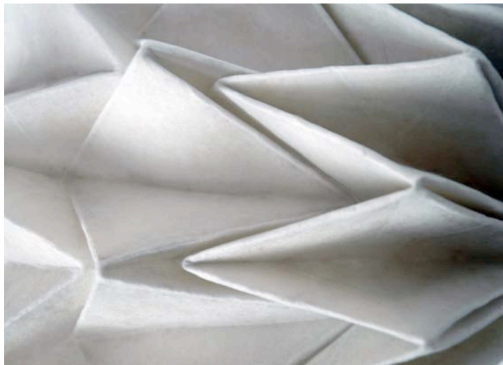
Figure 5: Origami folded textile with laser cut, laminated areas.

effect of synaesthesia and other less extreme overlaps between the senses can facilitate a whole body knowing of the material even when no physical contact occurs. This crossover of senses allows one to feel an object without touching it. Memory aroused by visual stimulus awakens haptic consciousness, as Pallasmaa says 'Vision reveals what touch already knows.' (2007, p.42) Although my making was mediated through a digital interface, feedback on material behaviour was immediately available. Burning, melting, clean cuts and scored surfaces could be observed as the laser worked its way across the surface. This playful, process rather than goal driven engagement with the laser freed my imagination, sparking ideas as to how I could employ this technology in my practice.