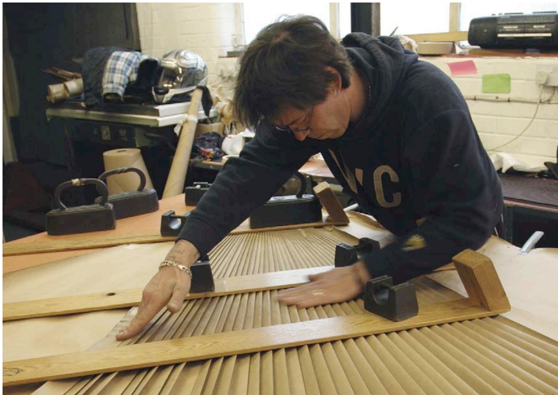
Figure 1: Hand pleating textiles at F. Ciment (Pleating) Ltd

Much textile design practice is still carried out intuitively, using hand-making processes informed by tacit knowledge gained through tactile, sensual exploration of materials. Our senses co-operate to construct a complete physical and emotional conception of an object from the feelings that are generated in the body. 'The interaction of various sensory media creates a multiple layering of meanings that 'all add up to one message'' (Kondo, 2004, p.207). The understanding given by this synthesis of the senses is far more complex than could be imparted by any single sense working in isolation. A vocabulary of touch builds up over our lifetime and is a cultural phenomenon learned along with language (Classen 2005). This whole body knowing, unarticulated and un-conceptualised is tacit knowledge, carried unconsciously within one but informing the activity of making.