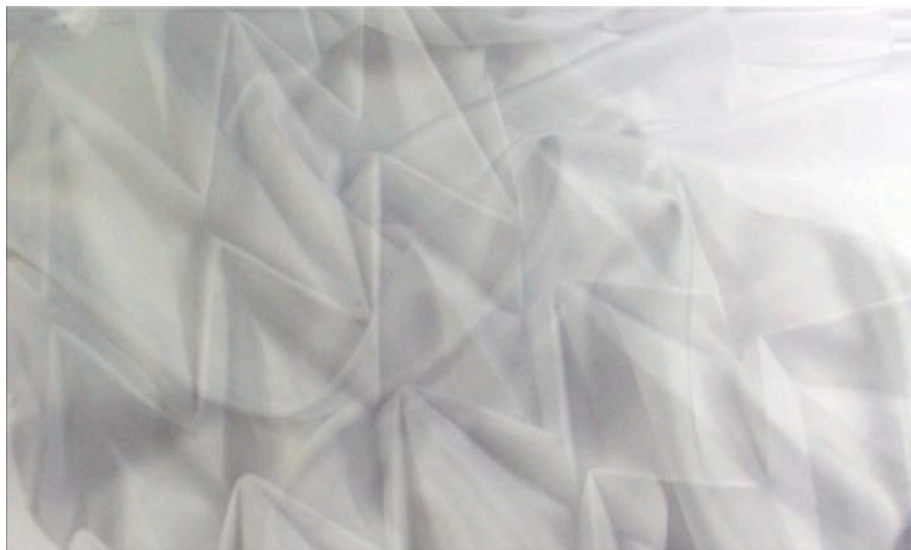
Figure 3: Video still with layered images contrasting hard and soft folds.

Using Final Cut Pro software various filters and effects were applied in an attempt to abstract the object to a degree that moved the image beyond the actual and into the realm of the conceptual. A very tight focus was used as a deliberate device to make scale ambiguous, freeing the imagination to perceive the object from new perspectives. The use of physical mirrors and the mirror facility within Final Cut allowed me to explore 'fictional' folds that could never exist in reality. By layering images I was able to illustrate graphically the potential of combined hard and soft folding although such pieces had yet to be physically completed. Although this overlaying of images was originally undertaken purely as an artistic device it suggested future development of work as dual layer structures. Such developments could increase possibilities for multi-functionality, like two-faced fabrics that demonstrate complimentary properties.