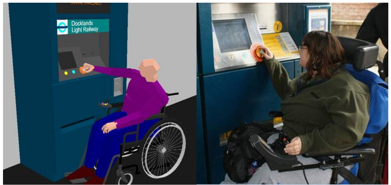
Figure 4: HADRIAN performing a task analysis in SAMMIE and the equivalent in the real world