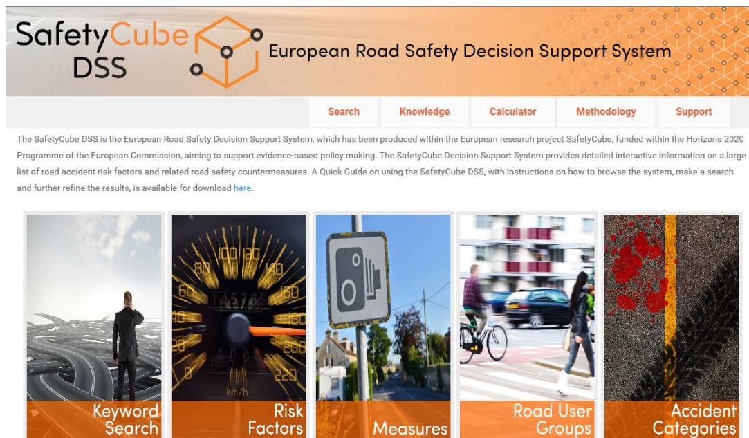
Figure 1: Main menu and entry points of the DSS.

The SafetyCube DSS Search is structured in three operational levels (with Level 0 being the system Home Page), as shown in Figure 2: Level 1 includes the Search Pages, Level 2 includes the Results Pages and Level 3 includes the Individual study pages. These are further described below (for a full description, see Yannis & Papadimitriou, 2018).