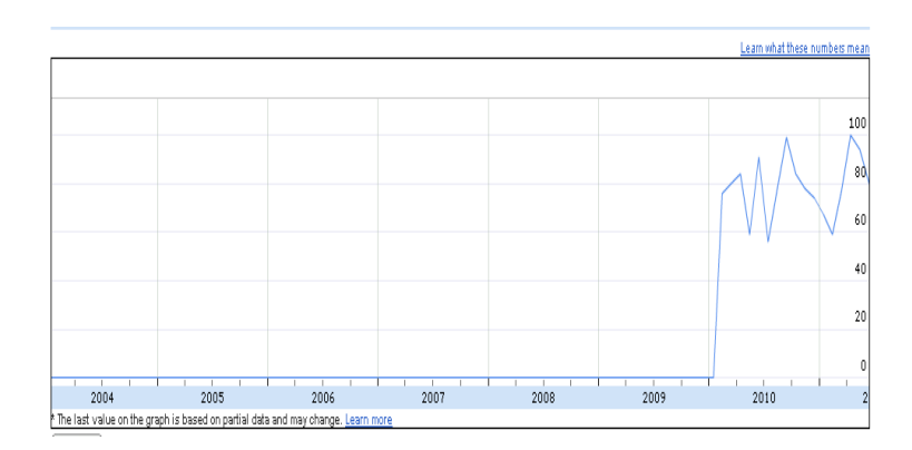
Figure 2: Google trends searching for "Social media" and B2B