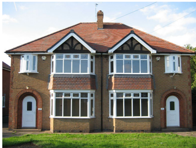
Figure 1: The Loughborough Matched Pair. The West house is on the left of the photograph, the East house on the right.

The exterior face of all windows were cleaned in both houses on 15/07/2021.