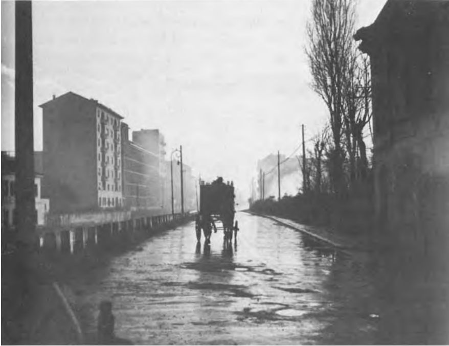
Gray buildings and streets. An anticipation of Antonioni's visual style in an early sequence of De Sica's Miracle in Milan

become repetitive or—in the case of Miracle in Milan —silly; its form and content simply used each other up, and the filmmakers wanted to go on to other things. Finally, too, the state had its word and censored what was left of the movement. In the late forties, the audience for Italian film was excellent abroad, but poor at home. The movement came under political attack—by the left for not providing a strong enough model for analysis and change, by the right for being too left, and by the center coalition government in power for keeping away Italian audiences and portraying Italy in a bad light abroad. The government won. Italy joined NATO and, as a recipient of aid from the Marshall Plan, was enjoined to control and if possible do away with any activity that might be taken for left-wing. In 1949 the Christian Democrats placed Giulio Andreotti in charge of the film industry with powers to subsidize only those films that were “suitable.. to the best interests of Italy.” Statements made by government ministers at the time indicate the direction being taken— the direction indicated in Miracle in Milan —toward a cinema of passivity and pacification: