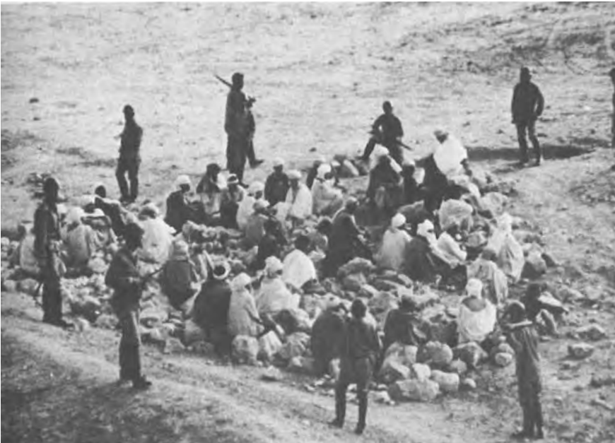
Below: the political landscape. Bertucelli's Ramparts of Clay (Cinema 5)