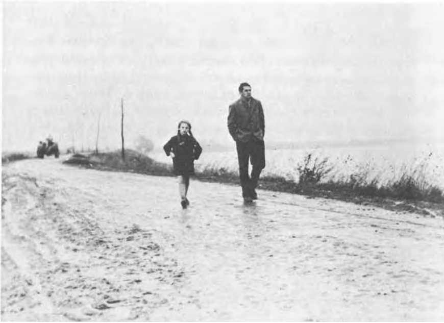
Aldo (Steve Cochran) and his daughter wander the flatlands of the Po.