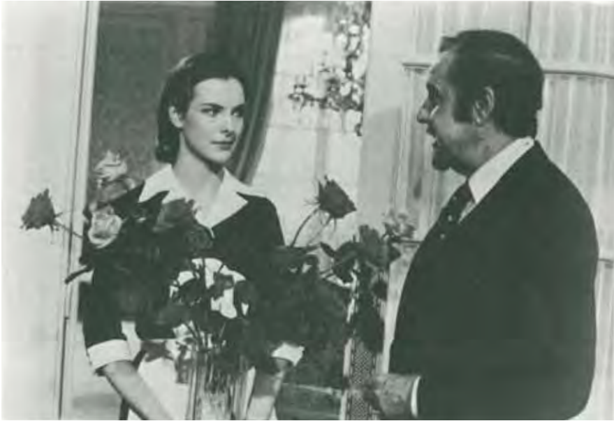
Mathieu (Fernando Rey) and one incarnation of his Conchita (Carole Bouquet). That Obscure Object of Desire

a woman who will not be a passive object, and the history of film is filled with her presence. Such a figure is (within the logic of misogyny) worthy of the wronged man's revenge and may be physically hurt for the emotional hurt she causes. In this film, it is, happily, not so simple. Throughout their story, Mathieu and his Conchita(s) play their roles of lecherous old man and reluctant virgin knowingly, willingly, and with some delight (it is with great delight that Mathieu tells his story to his traveling companions, who listen eagerly). The sexual terrorism they enact upon each other is not as vicious as that committed by Elvira upon herself in In a Year of Thirteen Moons or by Paul and Jeanne upon each other in Last Tango in Paris . Mathieu and Conchita keep seeking each other out, chasing each other away, returning, meeting by accident and by design (accident and design are often interchangeable in Buñuel's work). Around them their games are echoed by acts of the political terrorists, who create a general havoc paralleling the individual havoc created by the two (three) would-be/reluctant lovers.