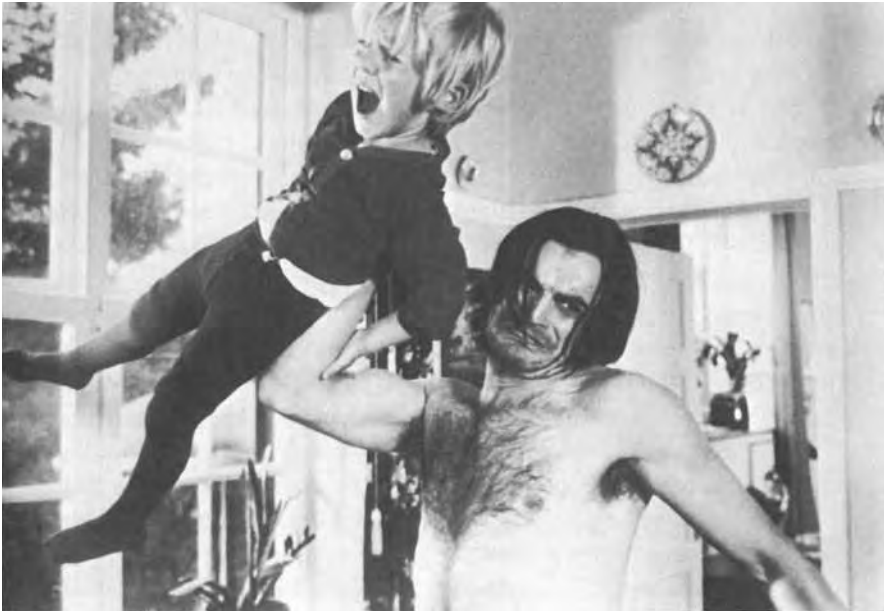
Domestic upheaval. La Rupture

by the blackmailer (who then kills the wife's husband)—when such an increment of absurdities occurs, melodrama reveals its other face, which is parody, of itself and of our acceptance of such absurdities. Because Chabrol details each element with equal care and gazes upon the characters with a visual embrace that zooms, tracks, exchanges points of view, and defines each character, everything and everyone takes on moment and portent. Quite unlike Godard, and the early Truffaut, Chabrol does not attenuate his narrative, nor does he accumulate material in a linear fashion, as does Rivette. Rather he builds out each sequence with sufficient dramatic detail and a more than sufficient attention to spatial relationships among the characters. Within these dynamics, exaggerated just beyond the necessities of convention, melodrama turns on itself and the ludicrous is visible within the serious.