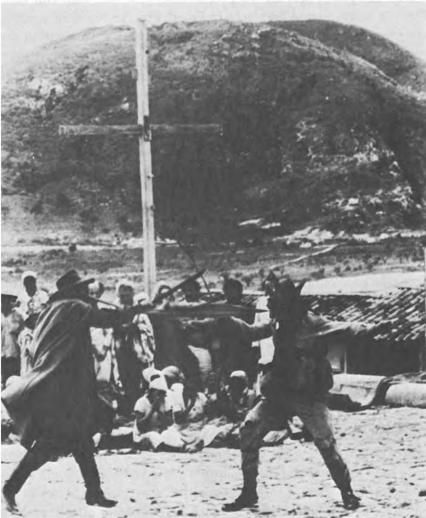
The fight between Antonio and Coirana. Antonio Das Mortes

film continually challenges the viewer to go through precisely the kind of integrations his characters face, to place the fragments of expression in an order that leads to understanding.