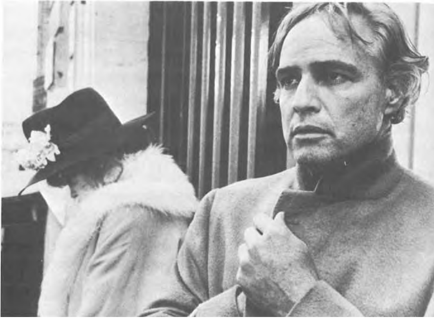
A figure of desolation. Paul (Marlon Brando) in Last Tango in Paris

in a room full of flowers, he is once again confronting himself, in a further attempt to understand his own subjectivity. "Who the hell were you?" he asks her. He says that during their life together he felt like one of her hotel guests. He curses her and asks her forgiveness, crying: "I'm sorry. I don't know why you did it. I'd do it too if I knew how. . . ." And he is called away by another of the hotel's "guests," a whore whose client he scares away, runs after, and beats up, as if he were attempting to relive or settle his past and deal violently with its sexual torments.