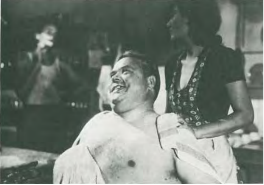
An aroma of sweat and lust. Ossessione