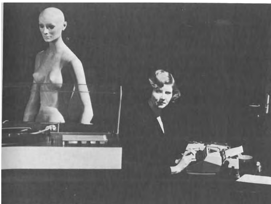
Above: Marlene, who looks (Irm Hermann). Below: Petra, Karin, and the mural (Margit Carstensen, Hanna Schygulla). The Bitter Tears of Petra von Kant