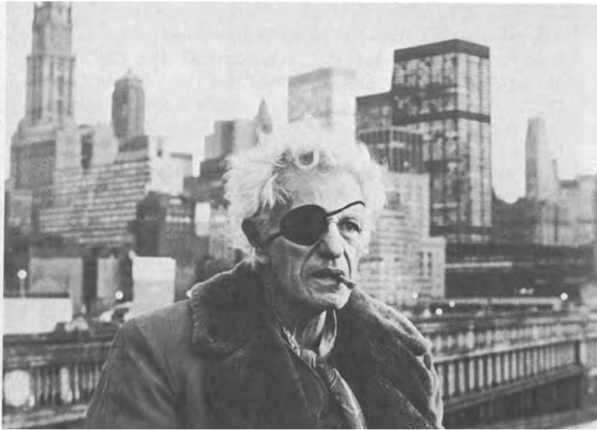
A meeting of cultures, a meeting of cinemas. Nicholas Ray ( above); Bruno Ganz and Dennis Hopper ( below) in The American Friend