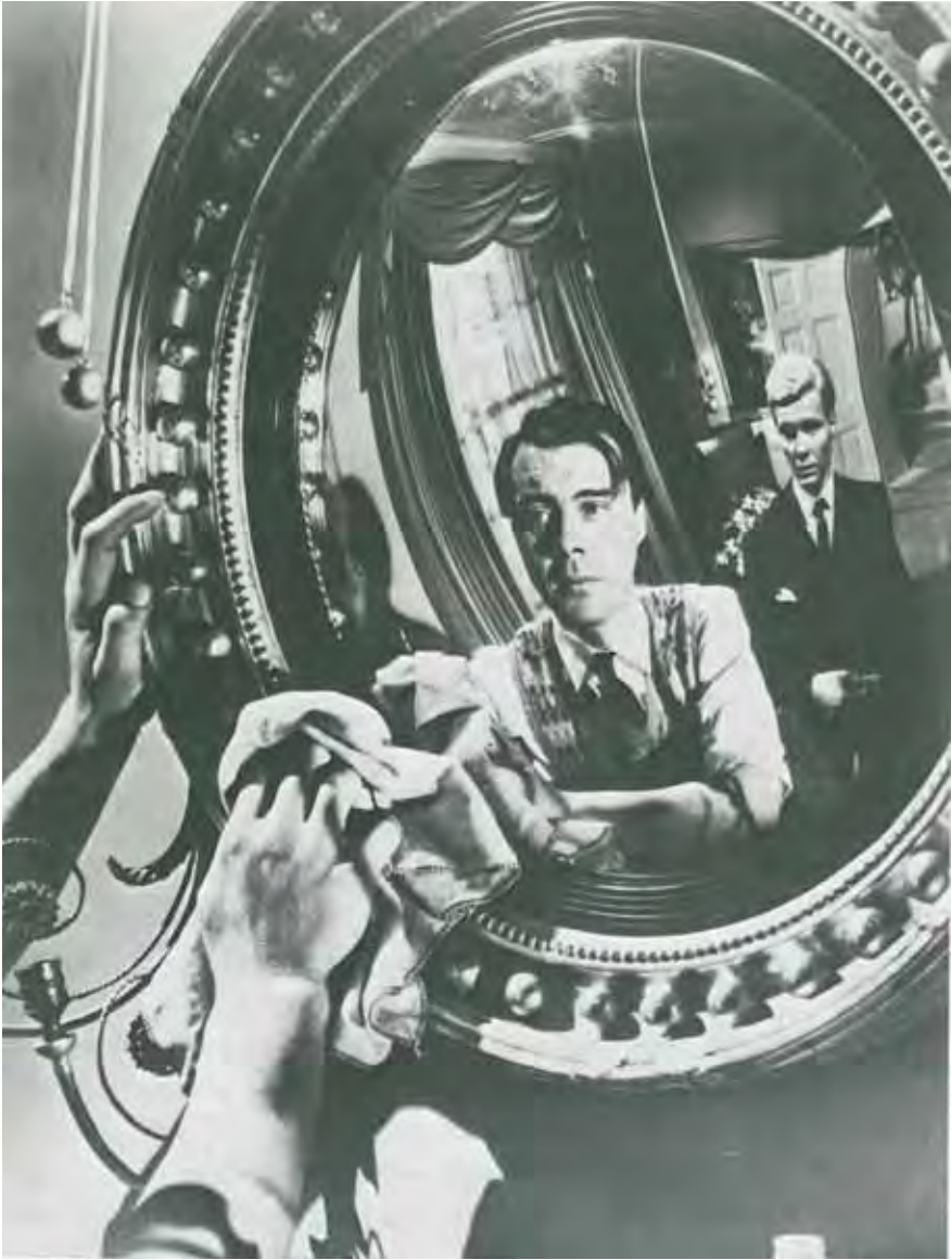
Servant and master (Dirk Bogarde, James Fox). The Servant

This allows him great flexibility. The Servant is both a critique of the British class system and an investigation of sexual manipulation and psychological cruelty that could exist independently of that system but are defined and clarified by it. The two couples, Tony, his lover Susan, Barratt, and Vera, stalk each other, reflect and deflect each other (quite literally, as