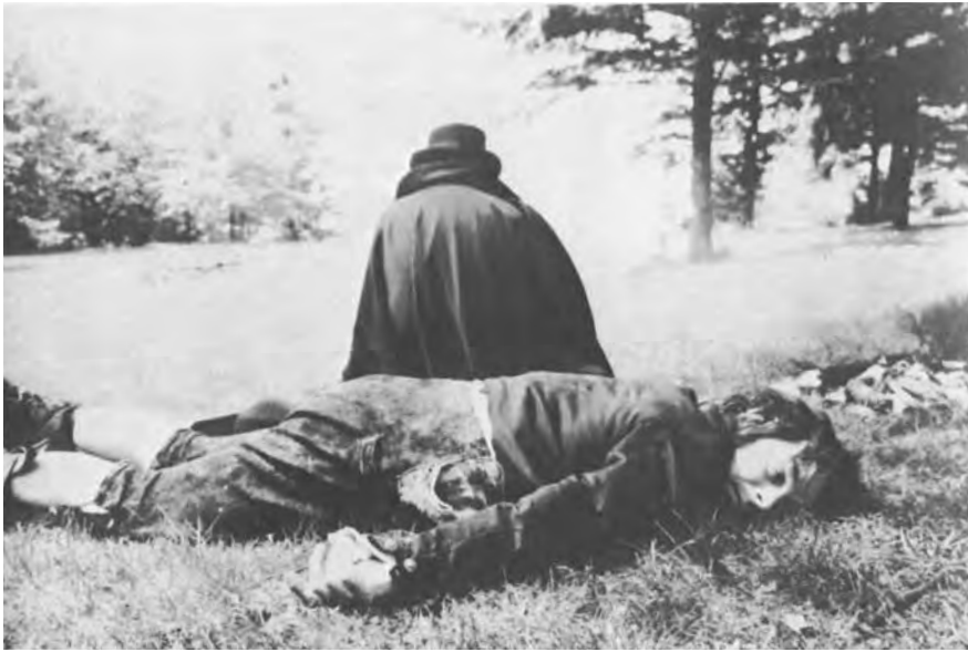
The Herzogian landscape. Every Man for Himself and God Against All.