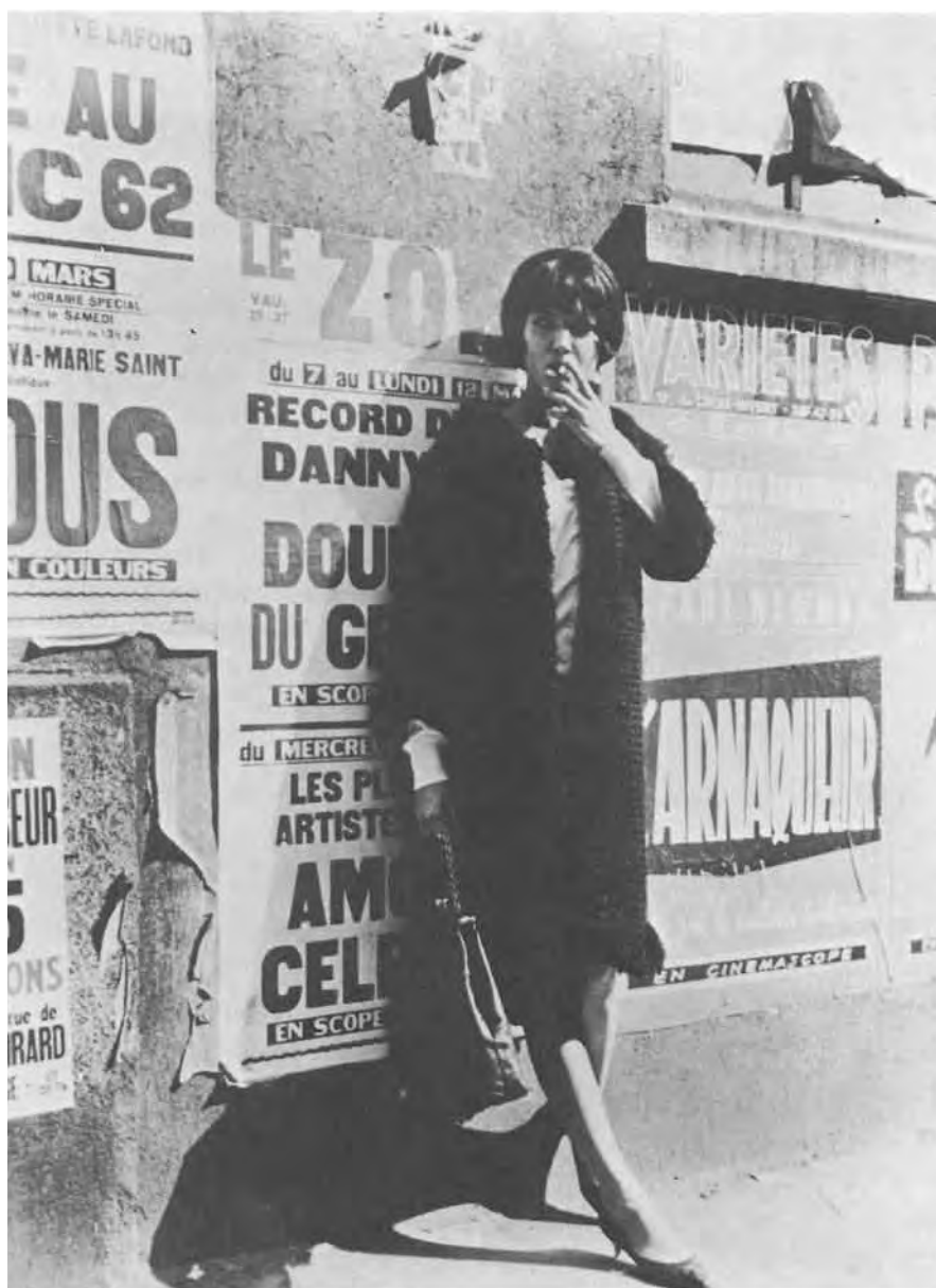
This page and next: the signs of work. Anna Karina in My Life to Live