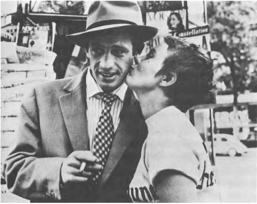
The Godardian gangster (Jean-Paul Belmondo with Jean Seberg). Breathless

look at film in general, an active engagement between film and viewer is maintained that comes from a forthright wish to please. In Truffaut's films, for example, the influence of Renoir manifests itself in an enveloping care for all the characters and the audience's attitude toward them. In the films of Claude Chabrol the pleasure is derived from the exercise of a delighted malignity. He is perhaps formally the most conventional of his colleagues, somewhat less concerned with restructuring narrative means than with narrative ends. In the best of his work he entertains Hitchcockian concerns for the violence that erupts in the most unsuspecting and unprepared of bourgeois circumstances. Chabrol is not concerned with the gangster side of the Hollywood thriller, as is Godard in Breathless and Truffaut in Shoot the Piano Player , nor is he much interested in the Parisian subculture, at least not after Les cousins and Les bonnes femmes . More than the others, Chabrol's eye is on the propertied bourgeoisie of the provinces or the Parisian suburbs, a class he is able to delineate by their gestures, clothing, and surroundings, by the visual design of their world. Chabrol has the finest eye for production design of any of his peers. While Godard has the best eye for cultural design, for abstracting the sign (in a literal and figurative sense) that sums up a social or political attitude, Chabrol can surround his