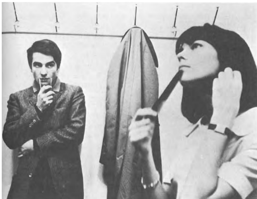
Paul and Madeleine (Jean-Pierre Léaud, Chantal Goya). Masculin-féminin

insight. Godard titles the sequence "Dialogue with a Consumer Product," and ends it with the sound of a ringing cash register.