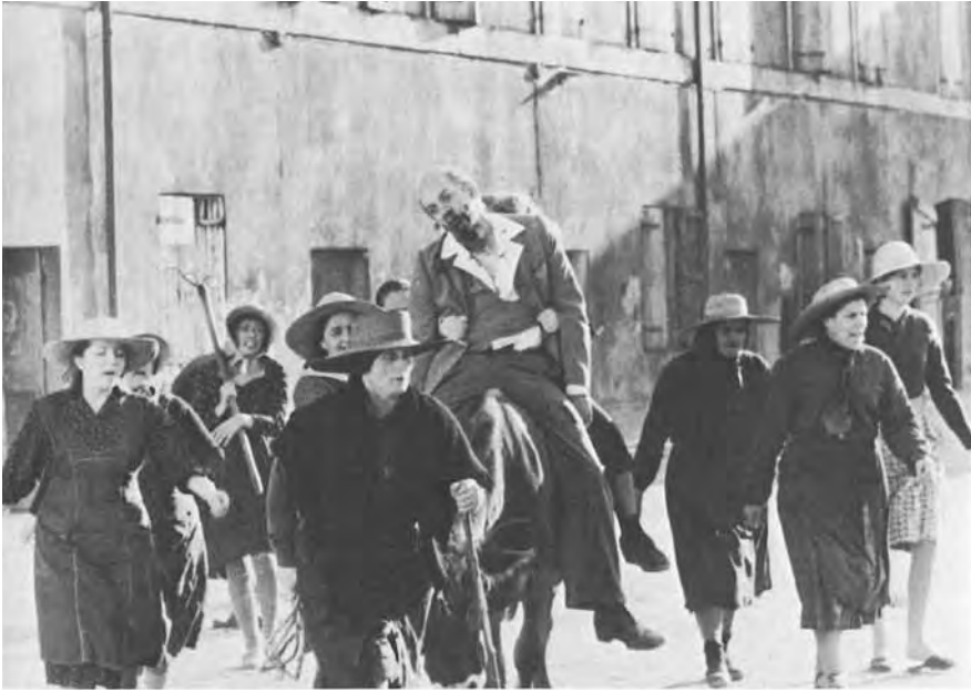
The peasants' revenge against Attila (Donald Sutherland). 1900

enemies; Alfredo's wife, who perceives more clearly than her husband the threat of the fascists, whom he attempts to placate, even at the risk of Olmo's life; and Attila, the local fascist leader.