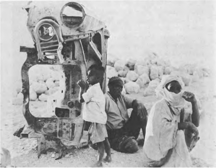
Above: the surreal landscape. Herzog's Fata Morgana (New Line Cinema Corporation)