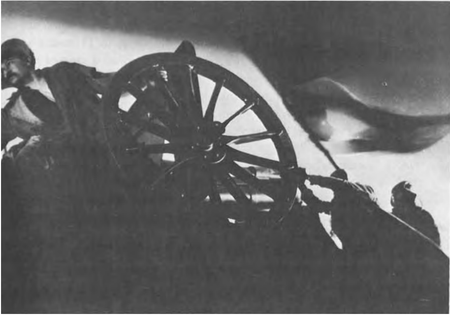
The Eisenstein image

New Wave filmmakers. When the German cinema was revitalized in the seventies, expressionism became more than an influence; it emerged as a problematic. Werner Herzog struggled with it, going so far as to remake Murnau's Nosferatu , imitating some of it and simultaneously removing many of its essential elements. Rainer Werner Fassbinder understood the expressionist urge. He never copied the style, but knew its intent, and created a mise-en-scène of observed entrapment that is in the expressionist tradition. However, Fassbinder, like his contemporary Wim Wenders, may have gotten his expressionist tendencies as much from American film noir as from his own cinematic tradition.