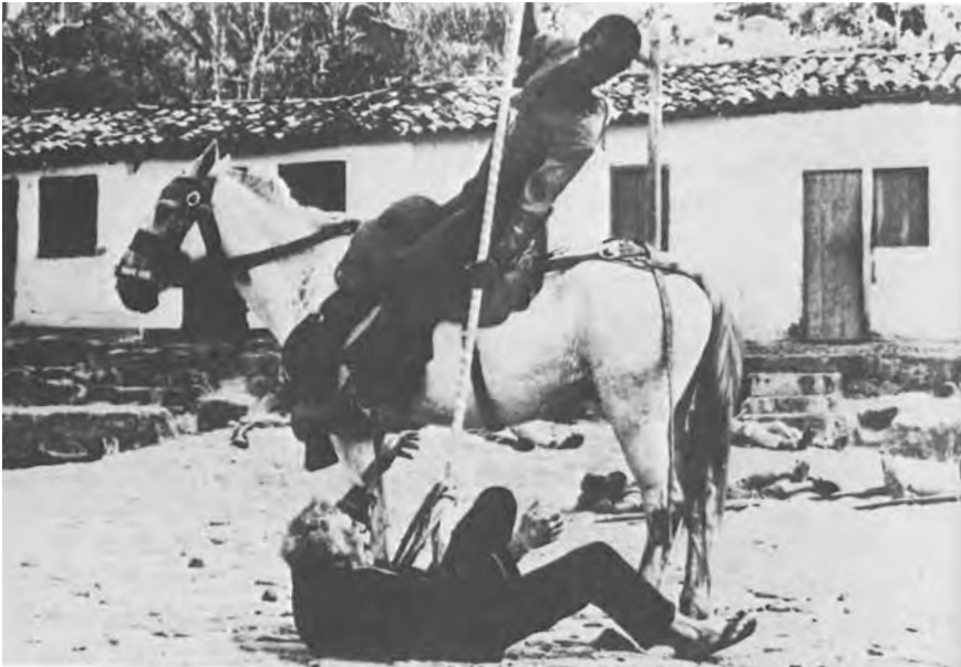
St. George slays the dragon.

Antonio das Mortes