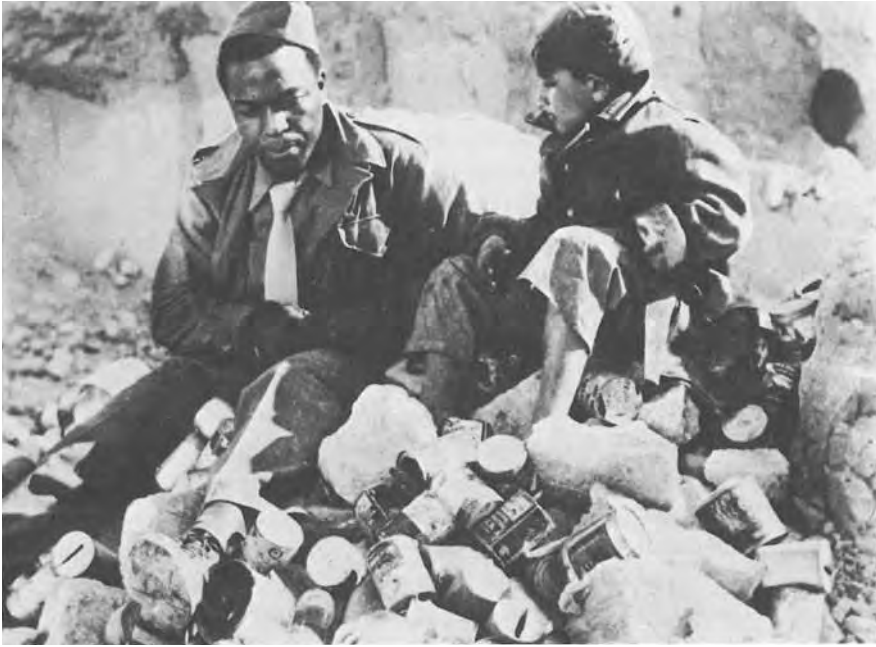
"Joe" and the little boy on the rubble heap. Paisan

the white puppet. The boy leads him away through the ruined streets to a rubble heap where the two sit. The soldier plays a harmonica and talks of his fantasy of a hero's welcome in New York, realizes it is a fantasy, and says he does not want to go home. He falls asleep, and the sequence ends in a manner typical of Rossellini's approach through the film. The little boy shakes him, tells him rather matter-of-factly, "If you go to sleep, I'll steal your shoes." The soldier sleeps. The image fades to black. 33