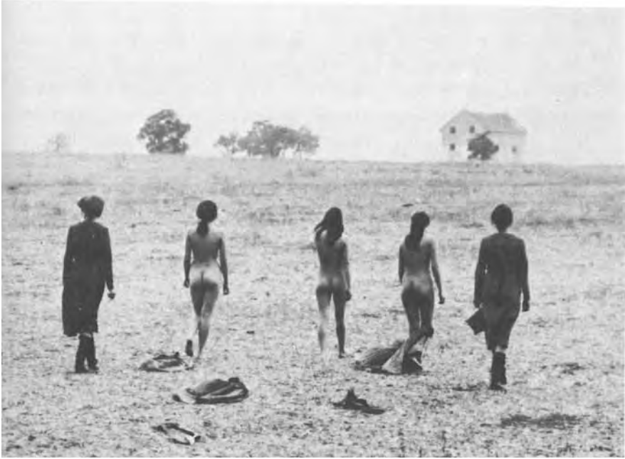
The Three Graces on the Hungarian plain. Red Psalm

workers . . . The man in the leather jacket says to the old man, "I don't wish to offend you, but you can't even read." The old man has obviously been reading! Something odd begins to happen: the man in the leather jacket attempts to continue, but begins rolling over on his side. "Shouldn't people be educated and rights given later . . . ?" he asks, halting, rolling over completely, and finally dying. This may be the first time in film that a character dies from the internal violence of his own oppressive ideas. If the clichés of capitalism are deadening and destructive, there is no imaginative reason why their destructiveness cannot affect one who generates them. In a film that depends on presenting an abstract concentration of history in which events are foreshortened and there is a desire to draw socialist ideas out of the myths of the peasantry and their closeness to the cycles of nature, the events of the film may take on mythic, even magic proportions themselves.