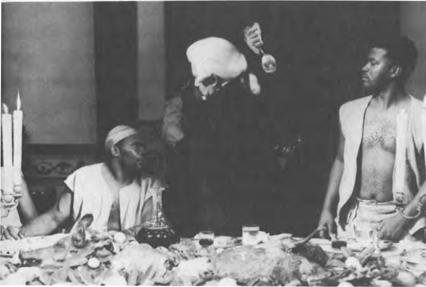
Master and slave. The Last Supper (Unifilm)