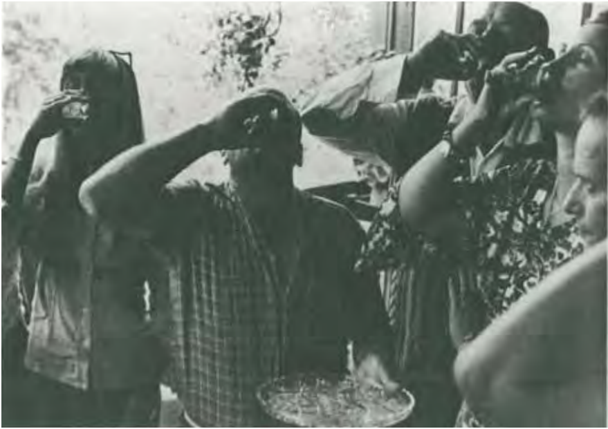
Family life. Rain and Shine

qualities of Jancsó's work, and are rather straightforward in narrative development and visual style. Both—indeed all of the recent Hungarian films I have seen—pay careful attention to their image-making, using color as a quiet and expressive function of the mise-en-scène . But these films do not use their mise-en-scène , as Jancsó does, to subordinate the conventional details of narrative development to the formal movements of figures and ideas. Rather they develop, in the traditional sense, a "story," though like Jancsó, a story that comes out of political history and reflects its agonies.