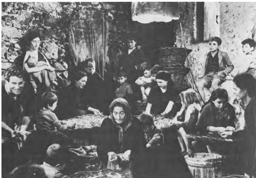
Families in groups.

Above: La terra trema; below: The Tree of Wooden Clogs