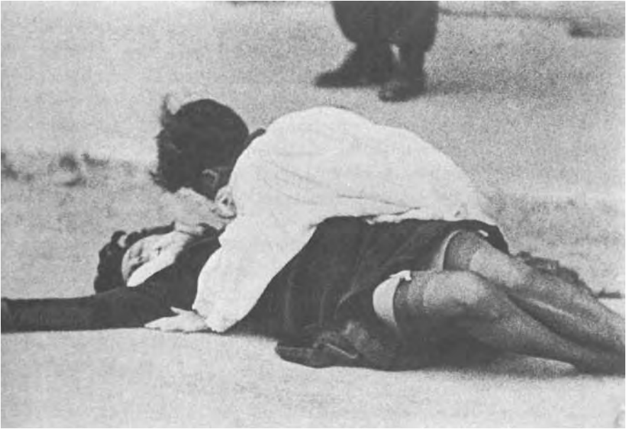
The death of Pina (Anna Magnani). Rome, Open City

so much reflect as contain and surround the desolation of the characters. They are their surroundings: poor, ruined, and seemingly without hope. But always enduring. The suicide of the young boy, Edmund, in Germany, Year Zero is an unusual act for a neorealist character, mitigated by the fact that Edmund comes to stand for Germany and the destruction it brought upon itself. In Rome, Open City , the deaths of Pina, Manfredi, and Don Pietro at the hands of the Germans are a sign of affirmation. Their humanity is transferred, within the film, to the children who carry on their struggle, and, outside the film, to the audience, whose understanding of their struggle validates it and their deaths.