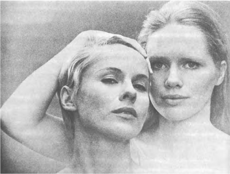
The famous Bergman two shot from Persona (above: Bibi Andersson, Liv Ullmann), and (below) one by Fassbinder from The Bitter Tears of Petra von Kant