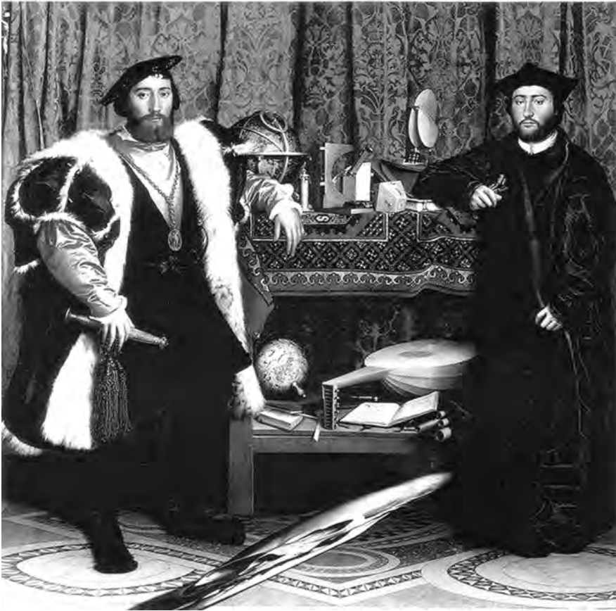
Figure 2. Hans Holbein the Younger, The Ambassadors (1533) National Gallery, London

Just as the viewer of Holbein's painting has to recompose the death's head from an angle, so Strether's dialogue with Mrs. Newsome is fraught with transatlantic misperceptions which no longer allow straight-forward readings or symmetrical oppositions.