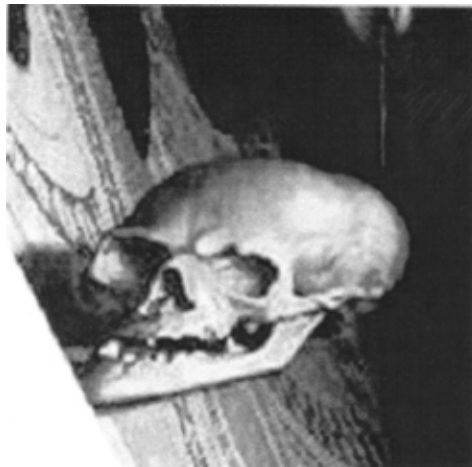
Figure 3. The recomposed head of death from Hans Holbein the Younger's The Ambassadors

Paris, in this sense, is over-signified, yielding surprising consequences and reactions. In Strether's eyes, the temptation of Paris is that consequences and interpretations can hardly be contained: “it piled up consequences till there was scarce any room to pick one's way among them. What call had he, at such a juncture, for example, to like Chad's house?” (123-24).