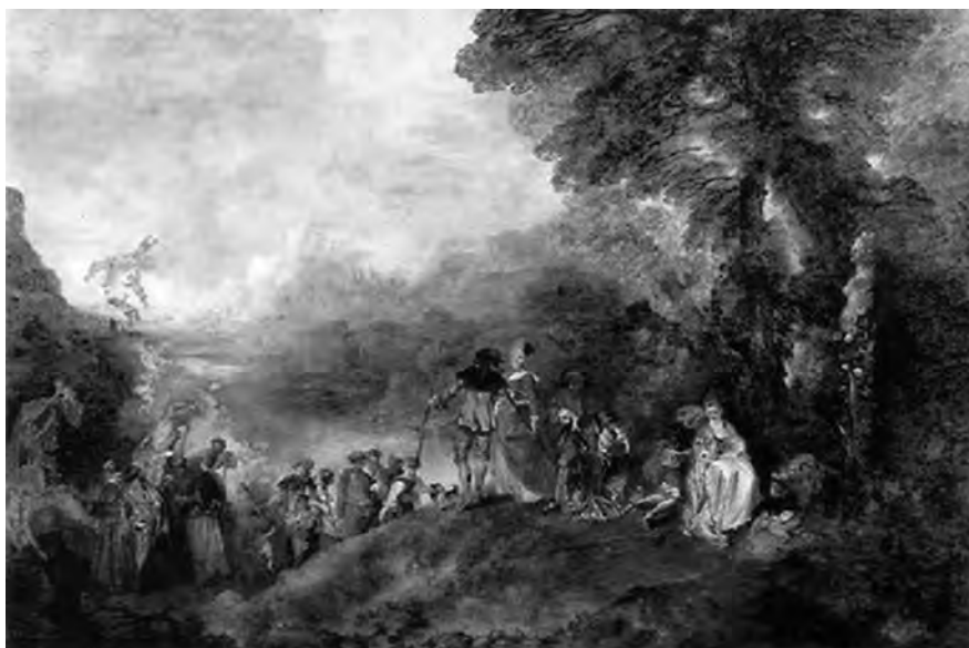
Figure 1. Jean-Antoine Watteau, Pilgrimage to Cythera (1719). Charlottenburg Palace, Berlin

with joyous Watteau-groups, feasting and making music under the shade of ancestral beeches" (97).