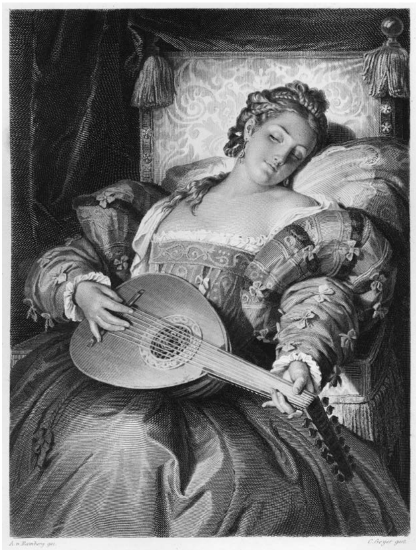
Princess Eboli. Steel engraving by Conrad Geyer from a drawing by Arthur von Ramberg. Friedrich Pecht, Schiller-Galerie (Leipzig, 1859), https://commons.wikimedia.org/wiki/File:Schiller-Galerie_komplett_Bild_17.jpg