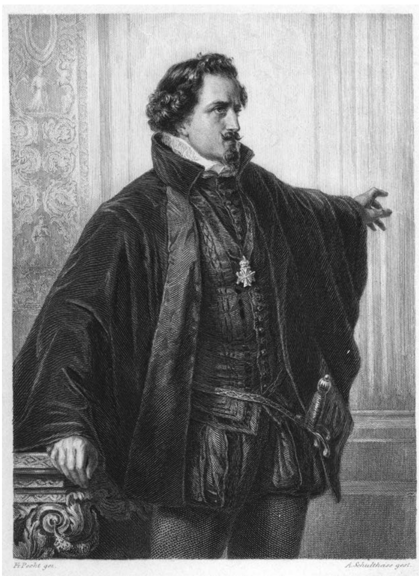
Marquis Posa. Steel engraving by Albrecht Fürchtegott Schultheiss from a drawing by Friedrich Pecht. Friedrich Pecht: Schiller-Galerie (Leipzig, 1859), https://commons.wikimedia.org/wiki/File:Schiller-Galerie_komplett_Bild_16.jpg