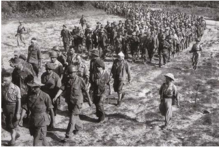
Figure 14. Viet Minh soldiers capture French troops and escort them to a prisoner-of-war camp, 1954.

frantic and belated request by the French for US intervention.” 4 Dulles, however, disagreed with Radford’s proposal. He feared that the United States might get embroiled in another protracted and costly war. He also thought that even if the Administration wanted to act unilaterally, Congress would be unlikely to authorise such action. Dulles’s sharp prediction proved correct; leaders from Republican and Democratic parties told him in early April that they would only sanction the use of US force if the Administration could obtain commitments from other allies, particularly Britain.