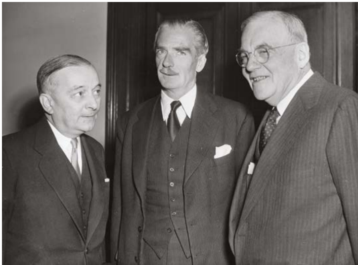
Figure 15. French Foreign Minister Georges Bidault (left), British Foreign Secretary Anthony Eden (centre), US Secretary of State John Foster Dulles (right).

Eisenhower concluded that the situation in Indochina had gotten to a point where "the French have used weasel words in promising independence and through this one reason as much as anything else, have suffered reverses that have really been inexcusable."