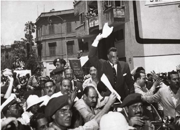
Figure 17. Egyptian Prime Minister Gamal Abdel Nasser cheered in Cairo after nationalising the Suez Canal.

One week later, Nasser announced Egyptian plans to nationalise the Suez Canal. Nasser declared that this was the “answer to American and British conspiracies against Egypt” and a response to “imperialistic efforts to thwart Egyptian independence.” 5 Nasser’s decision greatly concerned Eden, who immediately began plans to intervene militarily in Egypt. He believed that Nasser’s action was not only a threat to Britain’s economic interests but it was also a provocative attack on British power and authority. Eden immediately established an Egypt Committee (an inner circle of British Cabinet members that planned for a Suez operation) and warned Eisenhower that Britain was prepared to use force in Egypt. “My colleagues and I are convinced that we must be ready, in the last resort, to use force to bring Nasser to his senses”, Eden told Eisenhower on 27 July. 6