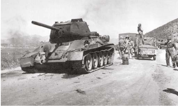
Figure 7. A Soviet-made North Korean T-34 tank knocked out during the UN led intervention on the Korean Peninsula.

to Korea. 22 Menzies was in London where he argued that Australian troops should not be sent to Korea due to their small number and that deploying these forces would prevent an Australian contribution to the Commonwealth defence in the Middle East.