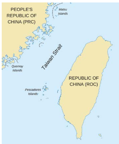
Figure 16. Map of the Taiwan Strait. Created by Andrew Kelly, adapted from map by NordNordWest (2008), Wikimedia, https://commons.wikimedia.org/wiki/File:Taiwan_location_map.svg , CC BY 3.0.

In Canberra, opinion was unanimous that defending the offshore islands was out of the question. Even before the outbreak of hostilities, Casey drew a line between the defence of Taiwan and the offshore islands. On 25 August he told Spender that there was a “distinction” between the two and “hoped that the US could see that.” 6 Thomas Critchley, Head of Australia’s East Asia Section in the Department of External Affairs, echoed Casey’s concerns over American policy. According to Critchley, “[the offshore islands] problem was critical [...] because of the dangers of US involvement.” He was particularly concerned that ANZUS obliged Australia to respond if the United States was attacked in the Taiwan Strait. In this event, any Australian failure to respond would be catastrophic for its relationship with the United States, even if Canberra was “left free” of any strict military obligation to defend the offshore islands. 7