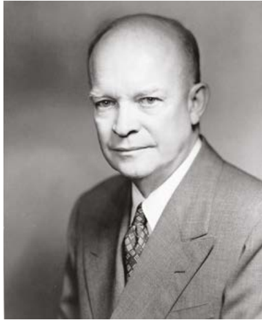
Figure 13. US President Dwight Eisenhower (1953-1961), 1952.

was becoming increasingly important to open a dialogue with the Communist regime to prevent Mao from moving “closer into the arms of Moscow.” 46