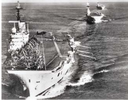
Figure 18. British Naval Carriers during the 1956 Suez Crisis.

climax on 29 October when Israeli forces, in collusion with Britain and France, invaded the Sinai Peninsula. None of the ANZUS powers, nor other Commonwealth countries, were informed beforehand of this secret Anglo-French plan. "For a long time the Middle East has been simmering", Eden said in a message to all Commonwealth Prime Ministers a day later, "now it is boiling over." 38 In the message, Eden detailed plans for an Anglo-French response, omitting entirely that London and Paris secretly supported the Israeli invasion in the first place. He explained that unless the Israelis and Egyptians withdrew within twelve hours, Anglo-French forces would seize the canal and overthrow Nasser. Nasser predictably rejected the ultimatum, which ultimately led to an Anglo-French invasion of Egypt on 5 November.