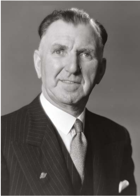
Figure 5. New Zealand Prime Minister Sidney Holland (1949-1957), 1951.