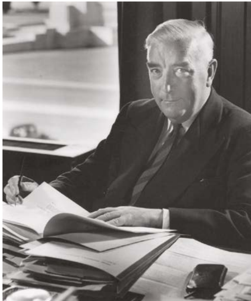
Figure 6. Australian Prime Minister Robert Menzies (1939-1941, 1949-1966), 1950.

of this assessment, External Affairs Minister Percy Spender continued Australia's push for a formal defence pact. US policymakers certainly recognised early on that Spender was determined to secure a closer relationship. After "differences of opinion rising from dissimilar views of the Japanese occupation policy [...] and by the difficult personality of Evatt", the State Department concluded, "Spender is desirous of establishing the closest and most cooperative relations with the United States and has in effect made this a cardinal point in his foreign policy." 9