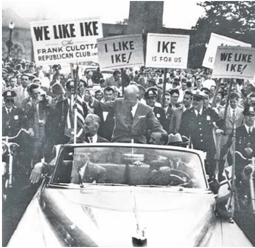
Figure 12. Eisenhower during the US Election Campaign in Baltimore, MD, September 1952.

Eisenhower's most immediate foreign policy problem was ending a protracted and costly war in Korea. "Of the manifold problems confronting me early in 1953", Eisenhower penned in his memoirs, "none required more urgent attention than the war in Korea." 45 He had famously visited Korea in late 1952, but had no precise idea about how to end the war. Fortunately for Eisenhower, in March US negotiators achieved a breakthrough with their North Korean and Chinese counterparts over an exchange of prisoners of war. After restraining South Korean President Syngman Rhee from continuing the war and accepting a compromise demarcation at the 38th parallel, an armistice was signed on 27 July 1953 that brought the Korean War to an end.