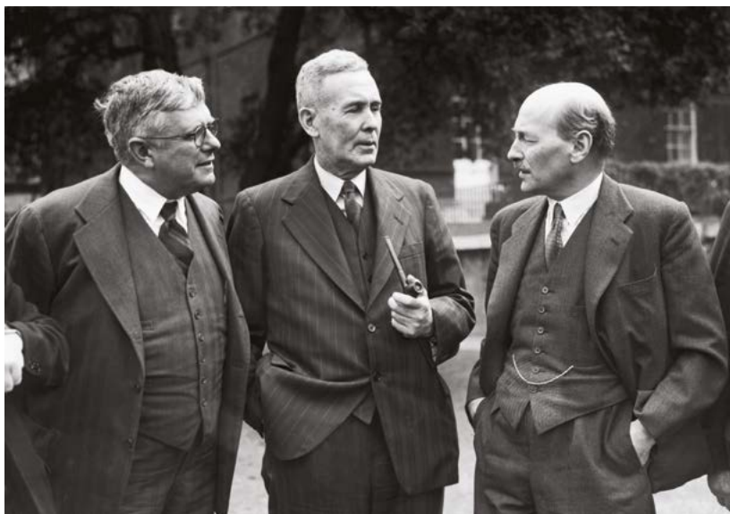
Figure 2. Australian Prime Minister Ben Chifley (middle), Australian External Affairs Minister Herbert Evatt (left) and British Prime Minister Clement Attlee (right) meet at the 1946 Commonwealth Conference.