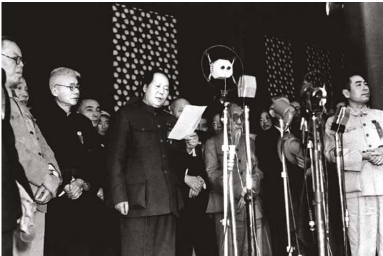
Figure 4. Chairman Mao Zedong proclaiming the founding of the People's Republic of China (PRC), 1 October 1949.

in Beijing. After a protracted civil war between the People's Republic of China (PRC) and the Republic of China (ROC), PRC Chairman Mao Zedong announced the establishment of the People's Republic of China on 1 October 1949. The defeated Nationalists, led by Chiang Kai-shek, fled to the island of Taiwan (also known as Formosa). As Cold War tensions continued to rise between the United States and the Soviet Union, the emergence of a major Communist government in Northeast Asia was an uncertain and disruptive situation that challenged the West. Mao's victory especially provoked extensive debate in Australia, New Zealand and the United States over whether to continue supporting Chiang's government, or instead recognise the PRC by opening diplomatic relations in Beijing and supporting its claim to hold China's seat in the United Nations. On the one hand, the ROC appeared fragile and corrupt, and struggled to justify its claim to represent all of China while its government only controlled the island of Taiwan. On the other hand, Western governments feared that awarding recognition to the PRC would strengthen the Soviet bloc and encourage further aggression from mainland China.