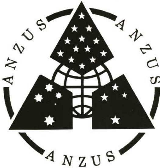
Figure 10. ANZUS logo.

military planning under the ANZUS Treaty. “In the case of the trilateral arrangement with Australia and New Zealand”, Dulles told Acheson, “we can, I think, make it clear that any organisation thereunder will not have the right to demand knowledge of and to participate in planning.” 48