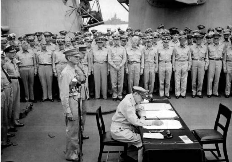
Figure 1. US General Douglas MacArthur signs as Supreme Allied Commander for the formal surrender of Japan during WWII, September 1945.

traditional links or kinship with the United Kingdom.” 2 While not going as far as suggesting a closer US relationship would come at the expense of relations with Britain, New Zealand Prime Minister Peter Fraser made similar comments about the importance of the United States to the future conduct of his country’s diplomacy. “New Zealand realises”, he said, “that the security and future development of the Pacific can only be satisfactorily achieved in cooperation with the United States.” 3 In short, Britain’s self-ruling Dominions in the South Pacific had come to the understanding that the United States had replaced Britain as the predominant power in the Pacific, and US officials certainly agreed. The Pearl Harbor attack had utterly discredited the pre-war isolationist movement, and had set the United States on a path toward becoming a global superpower. Nowhere was this more evident than in the Pacific,