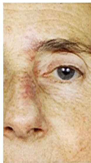
Figure 3 Show a typical treatment outcome using the laser parameters predicted by the computer model