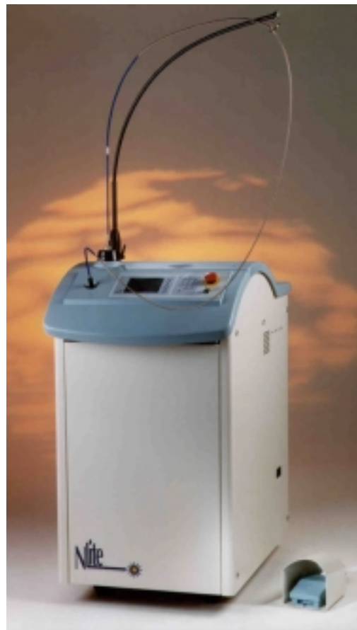
Figure 1 Resolved industrial design product – Chromos 585

In order to optimise the laser parameters used for the treatment of PWS, a computer model was developed by a team consisting of the academic partner, laser technologists from the industrial entity, and medical specialists in the field, the academic partner in this case being