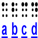
Figure: Letters in Standard Braille are formed by a combination of six raised dots [4].

Louis Braille, a young Frenchman, developed Braille in 1829 at the age of 20 [3]. Braille had been accidentally blinded at the age of three and attended a school for blind children in Paris. At the age of 11 he was introduced to a tactile code developed to allow soldiers to communicate in dark or smoky conditions. The code was based on a twelve-dot cell, 2 dots wide by 6 dots high. A combination of dots stood for a letter or a sound. Braille adapted the code and, by reducing cell size from 12 to six, enabled the fingertip to completely encompass the cell. This allowed the reader to gain an impression of one cell and then quickly move to the next. Braille continued to refine his writing system until his death