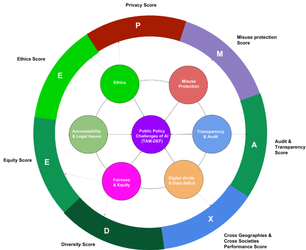
Figure 4: An integrated view of DEEP-MAX Scorecard under TAM-DEF framework for Public Policy challenges of AI

The DEEP-MAX scorecard has been deliberately chosen to be slightly different from TAM-DEF framework. It could be noticed that one of the six components of the TAM-DEF framework, namely Accountability and Legal issues, has been kept out of DEEP-MAX scoring system. One can also observe that two of the TAM-DEF framework components have been split into two scores per component. Fairness and Equity component of TAM-DEF framework is split into two scores of Diversity and Equity. Similarly, Ethics component has been also split in two scores of Privacy and Ethics.