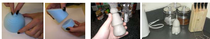
Figure 4 Example of foam models (Casio, Scotland and Casio, England)

Based on the feedback provided by the clients, the designer groups developed further detailed design proposals. This included construction of 3D sketch models to test various design features such as ergonomics, size and overall product shape and its fit within a kitchen environment. At the end of this design stage the designer groups forwarded their CAD files to their clients.