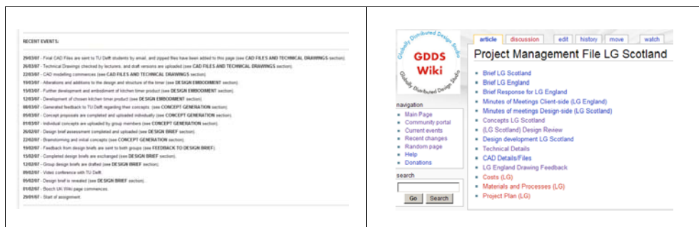
Figure 2 Example of a Notice board (Bosh, England) and Project Management entry page (LG, Scotland)