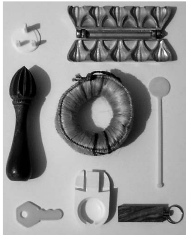
Figure 1: Products for evaluation

The resources used for the activities undertaken were a selection of products from different countries. These are illustrated in Figure 1.