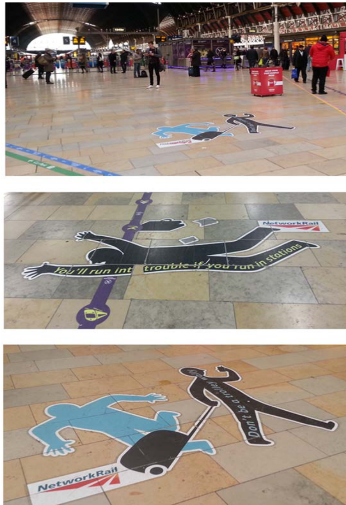
Fig. 2. Floor signage (Paddington Station)