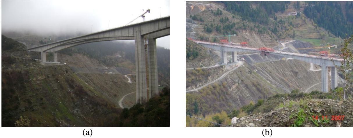
Figure 2: Metsovo bridge, (a) General view, (b) key of central span.

The proposed framework has been applied to a left section (Figure 2b) of the ravine Metsovo bridge (Figure 2a) of Egnatia Motorway. The bridge is crossing the deep ravine of Metsovitikos river, 150 m over the riverbed. This is the higher bridge of Egnatia Motorway, with the height of the taller pier M2 equal to 110 m. The total length of the bridge is 357 m.