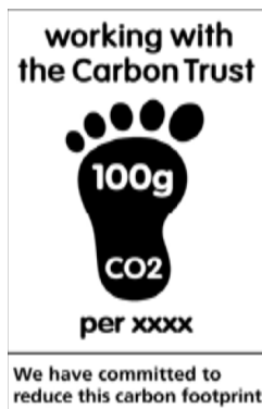
Figure 2. Carbon Footprint Label, (Sinden, 2009)

Carbon footprinting has been around for many years, recent work by Finkbeiner (2009) presents a good account of the current developments in Carbon footprinting, but it is only in the last three years that Carbon footprinting has become a marketing tool alongside the environmental benefits associated with it. The Carbon Trust has developed the publicly available specification (PAS 2050) and has been working with a number of leading organisations in the UK to implement this methodology into (primarily) consumer facing brands. Figure 2 shows the standard Carbon Footprinting label that accompanies many products, whilst this information is useful it does appear simplistic and no indication is given against an 'average'.