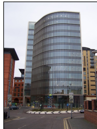
Figure 2: View of completed building