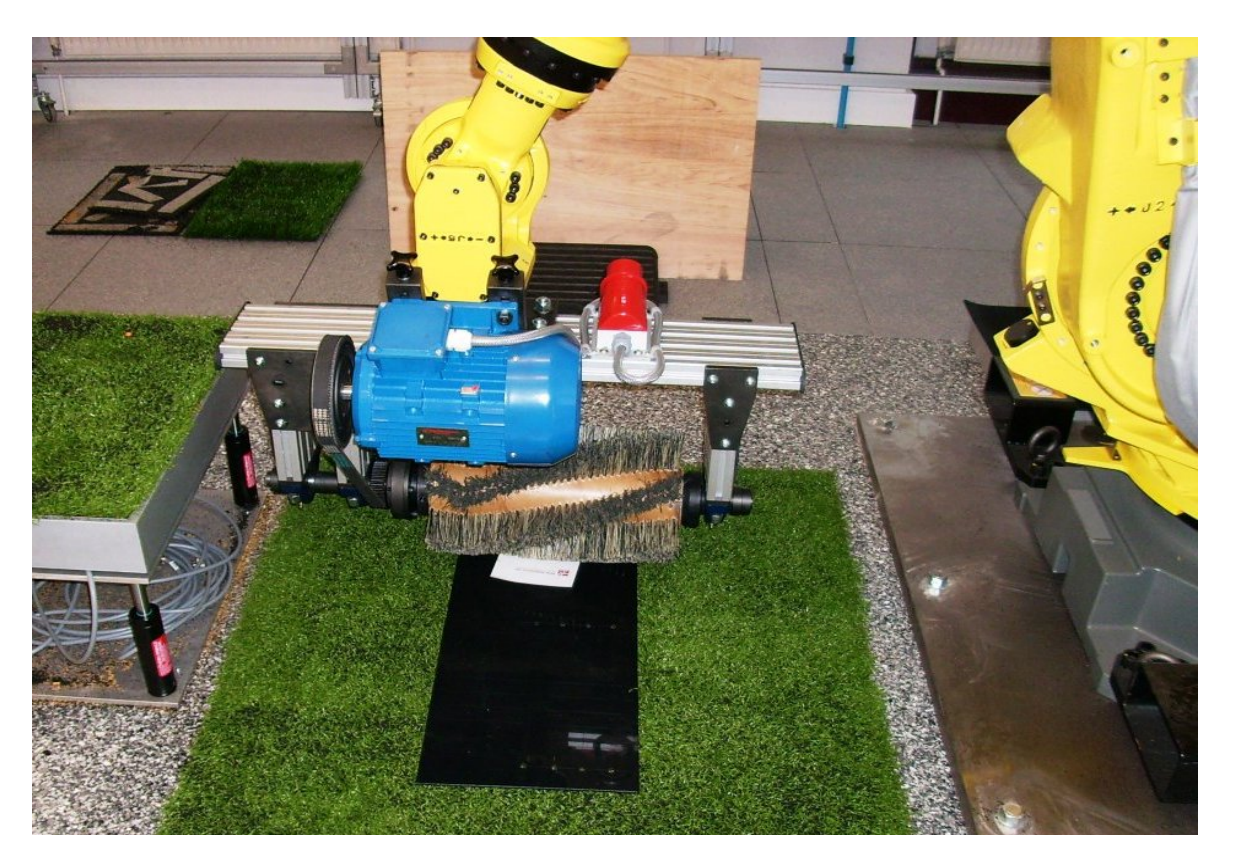
Plate 3 – Fanuc robot arm with power brush mounting (guard removed). The board and paper is to set the penetration depth (see page 9).