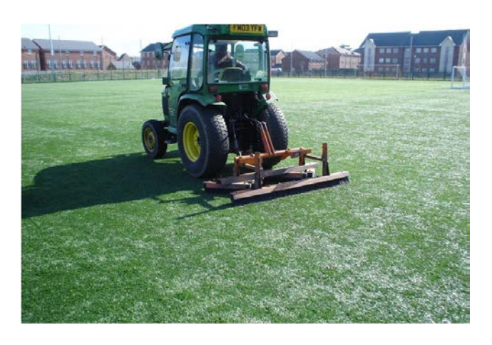
b) Zig zag brush