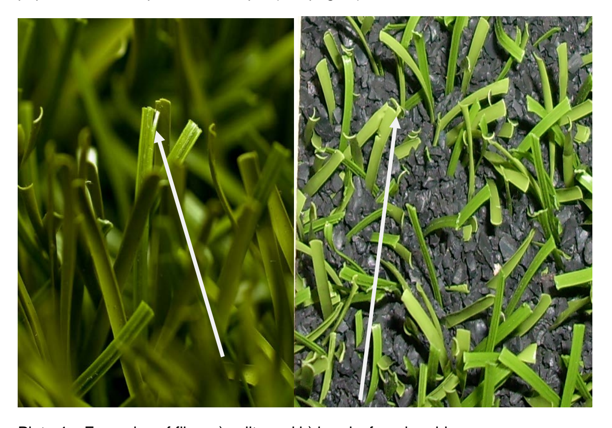
Plate 4 – Examples of fibre a) splits and b) breaks from brushing