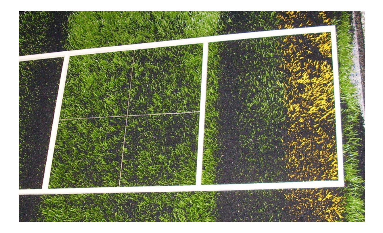
Plate 2 – Measuring quadrangle frame, set on a rubber crumb infilled system – the central portion showing loss of fill highlights the channel tracked by the power brush.