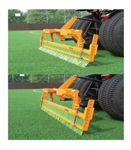
Plate 1: a) Flexi-comb brush