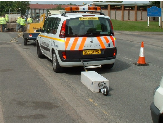
Figure 3. GPR survey vehicle, with antennae housing in towing position

GPR data were referenced to local site chainages, which were marked from fixed features which could be easily found if the site was re-visited (such as centre lines of road junctions). It has been known for site chainages to be referenced to parked vehicles, or have descriptions in site notes such as "lamp-post", which prove extremely unhelpful when later trying to establish site locations. The importance of accurate site chainages can often be overlooked during a site investigation, and for sites where changes and features occur at relatively close spacings and short distances, an accurate chainage system becomes even more significant. The most accurate and carefully collected GPR data can become virtually useless if its location on the site is uncertain or unknown.