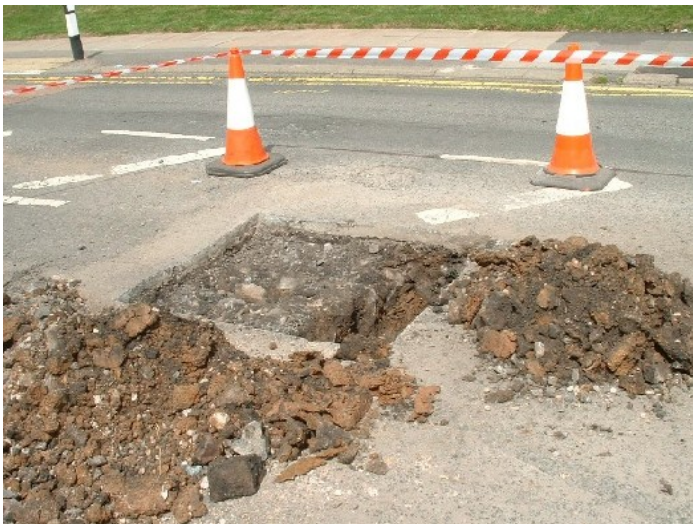
Figure 2. Trial pit showing bituminous road pavement, pitchings and silty clay subgrade

The bituminous road pavement was generally in a poor condition and contained several areas where previous maintenance had been conducted. Ruts and cracks could clearly be observed on both repaired and un-repaired areas, and maintenance work to plane off of the bituminous layer and replace it with new material was being considered. Information on the depth of the various layers in the road, especially to the bottom of the bituminous layer along the length of the site and on the presence and thickness of sub-base, had to be determined before planing could be planned.