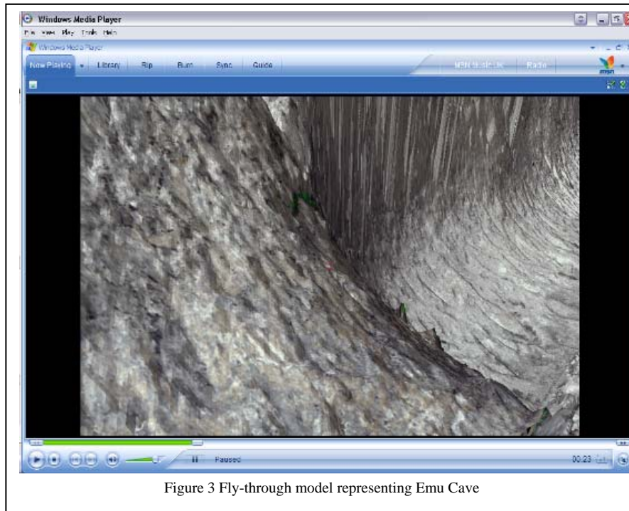
Figure 3 Fly-through model representing Emu Cave

over 200 handprints and motifs, (Chandler and Fryer, 2005). A second field trip to the Blue Mountains west of Sydney allowed the recording of the curious “Emu Cave” (Figure 2). This consists of a series of engraved markings similar to emu footprints and believed to be a totem used to represent one particular group of aborigines who lived in the area until the nineteenth century. This site was recorded using seven pairs of images and small stick-on targets, coordinated using a reflectorless total station. DEMs, orthophotographs and fly-through models were generated using the LPS software (Figure 3). The resolution of the DEMs was