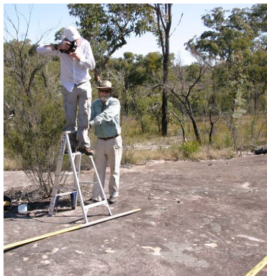
Figure 1 Image acquisition

During a six-month period of study leave spent in Australia, the first author working in conjunction with the third developed a simple methodology for recording aboriginal rock art. This combined the use of consumer-grade digital cameras, simple control and commercial digital photogrammetric software to extract digital elevation models (DEMs) and orthophotographs and to create fly-through models. This combination appeared prudent, because of the need to ensure that field equipment was light, robust and simple to operate. These authors had already been demonstrating the potential of consumer-grade digital cameras (Chandler et al. , 2005a) and cheap sensors seemed ideally suited. Discussions with specialists in rock art (personal communications: Taçon, 2004; Ogleby, 2004) revealed the need for cost-effective solutions, particularly if recording could be conducted by those with rock-art expertise and without extensive training. A full description of the technique and its