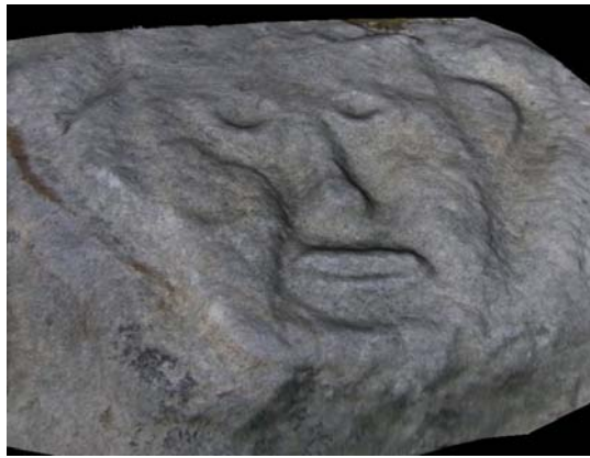
Figure 5- Draped orthophoto representing rock-art

Originally, it was envisaged that photogrammetric data extraction would be carried out for just a few exemplars. However, many of the volunteers have become so interested in the technique and procedures, that it is now expected that DEMs and orthophotos will be extracted for all but a few less significant sites. The volunteers have also made universal use of the PI-3000 Pro Image Surveying Station software (Topcon, 2006) rather than LPS and have generally become