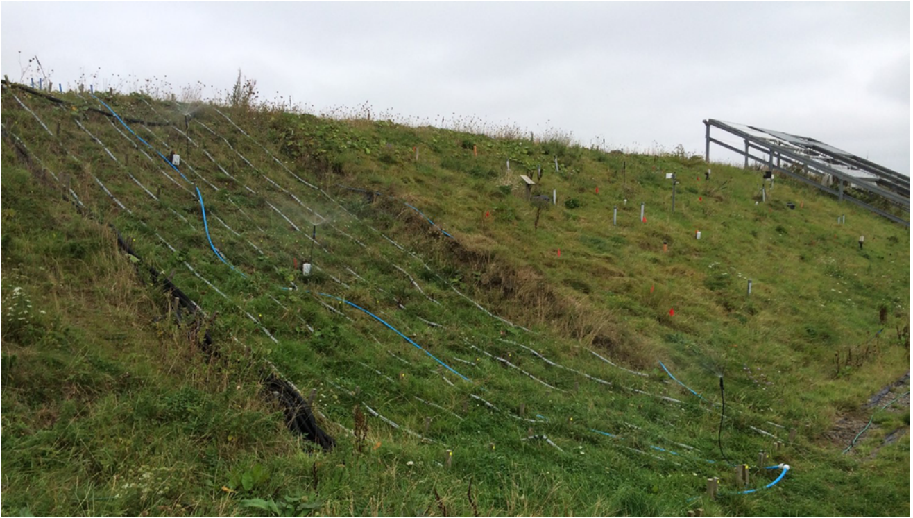
Fig. 1. BIONICS research embankment, Northumberland, UK. The facility has been used to understand earthworks behaviour in relation to climate and test new instrumentation approaches (photograph courtesy of R. Stirling, Newcastle University, UK).

mean it is now possible to send significant quantities of data via mobile phone networks. Local wireless data networks that transmit between adjacent monitoring nodes are also becoming commonplace, and are particularly helpful in geographically diverse systems.