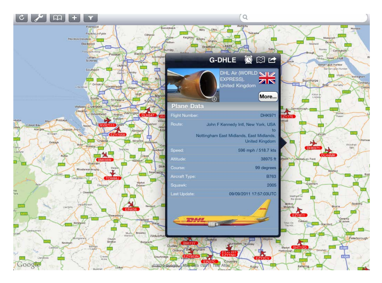
Table 1 Data fields available through the Plane Finder HD app

Figure 2 Screengrab of Plane Finder HD app with the details of DHL flight DHK971 from New York (JFK) to East Midlands Airport (EMA) displayed (image reproduced with kind permission of Pinkfroot).