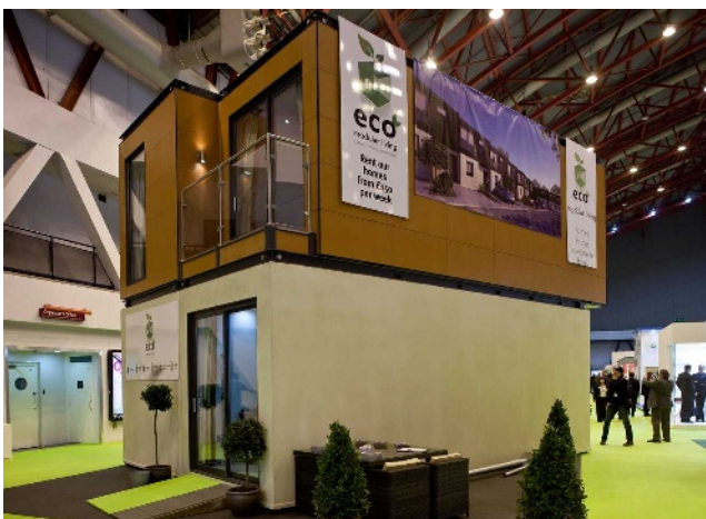
Figure 1. A two-storey containerised housing system by Eco Modular Living Ltd