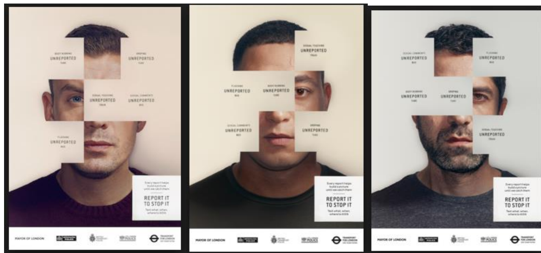
Figure 2. Still images from the ‘Every Report Builds a Picture’ campaign