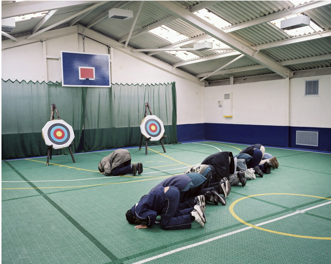
Figure 2: ‘Breaking for midday prayers’

fields outdoors, closing eyes inside of tents, sitting around the campfire, or kneeling on a sports hall floor: