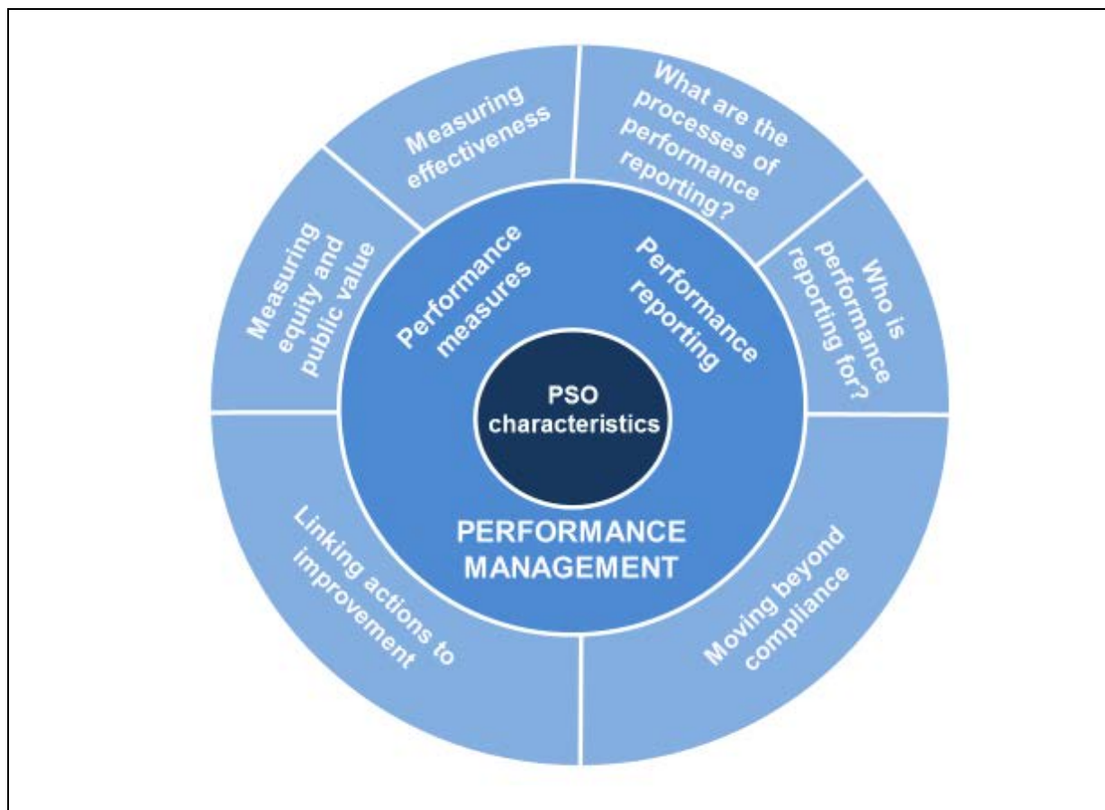
Figure 1 Conceptual model of doctoral research project

Andrews (2004), Andrews et al (2005), Andrews and Martin 2010, highlighted in their studies, how external contextual factors such as devolution and EU immigration have affected the reported performance of local authorities in England, Wales, and Scotland. There has been little or no focus within the academic scholarship about using performance measures to inform internal performance reporting systems such as budgets. As the conceptual model for this project illustrates in Figure 1, this doctoral thesis will aim to address this knowledge gap by seeking to understand how PSOs produce and report