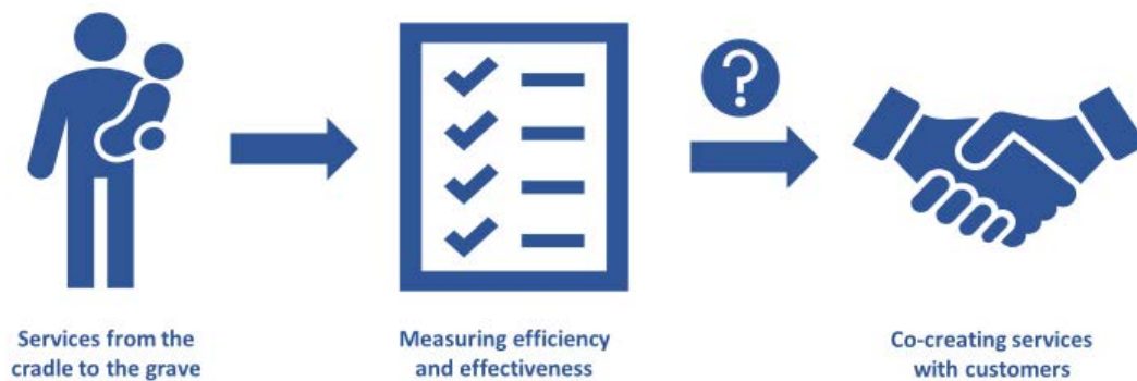
Figure 3 Summary of initial research findings

Therefore, the initial research findings from stage one of this project, suggest that UK PSOs are using performance measures, reporting, and management activities in such a way that are reflective of aspects of PA and NPM, but not of PSDL. Osborne, Radnor, and Nasi (2013) also emphasised the need for PSOs to use operations management and a public service-dominant approach to produce more efficient and effective public services. This would in turn help UK PSOs to move towards co-creating services with service users and customers, and therefore create public value (Osborne, Radnor, and Nasi, 2013). However, the initial analysis from stage one of the project, suggests that PSOs are not moving towards co-creating services with service users and customers, and are therefore failing to create and deliver public value to UK citizens.