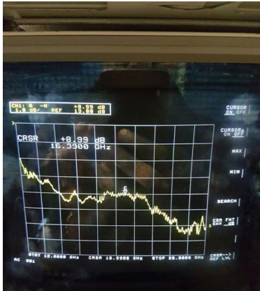
Fig. 4. Cu conductive aerosol coated antenna gain measurement over 12 to 20 GHz

The antenna was assessed over the 12 to 20 GHz frequency range displaying a gain of 8.99dB at 16.39GHz as shown in Fig. 4.