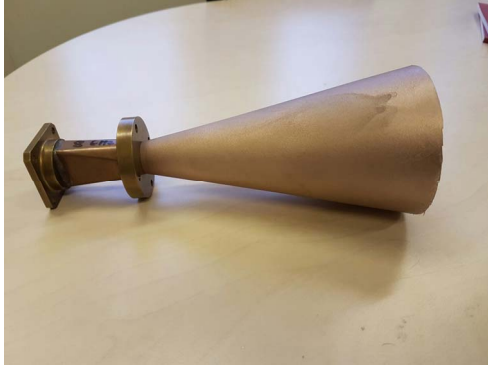
Fig. 3. Conical Horn Antenna.

The antenna was assessed over the 12 to 20 GHz frequency range displaying a gain of 8.99dB at 16.39GHz as shown in Fig. 4.