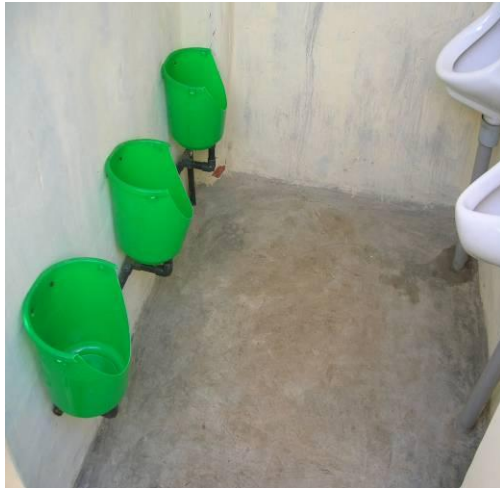
Photograph 2. Water less urinals- green ones for nursery school children.