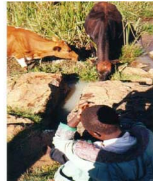
Figure 3. Source of water for Monica, unprotected spring

After SODIS the water was either left outside or brought into the house to cool overnight. The water in the SODIS