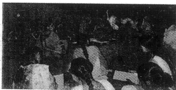
User Group members being trained to collect and pay water tariff.

Capacity building of the Municipality has resulted in effective sustainable planning of institutional development and O&M system being in place between the PHED, the Municipalities of Bolpur and Raghunathpur and the community. MIS is an important component for sustainable O&M.