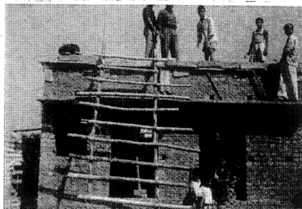
Pay & Use Toilet

Taking into consideration women users preference for private family toilet cubicle instead of community latrines, Group Latrines have been designed for a household cluster approach in slums. The Group latrines will provide separate family toilet cubicles with common sewers, pits, water source etc.