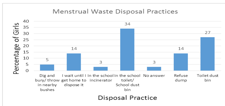
Figure 2. Menstrual waste disposal practices