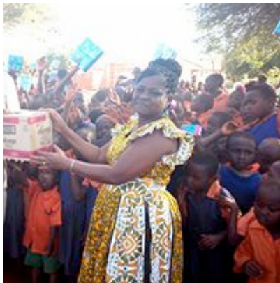
Photograph 2. Makueni County First Lady conducting MHM school outreach