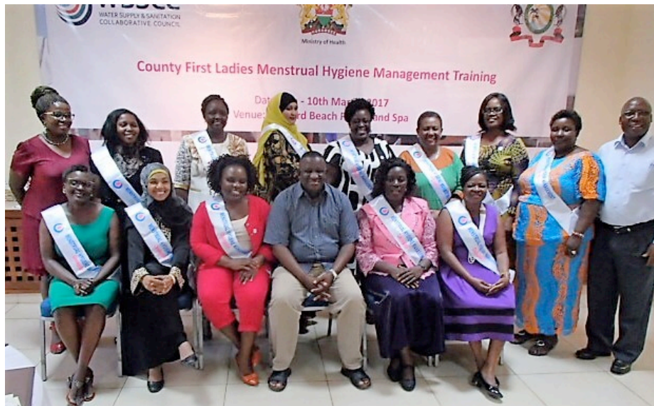
Photograph 1. Crowned champions; County First Ladies & 2 Tanzania Members of Parliament