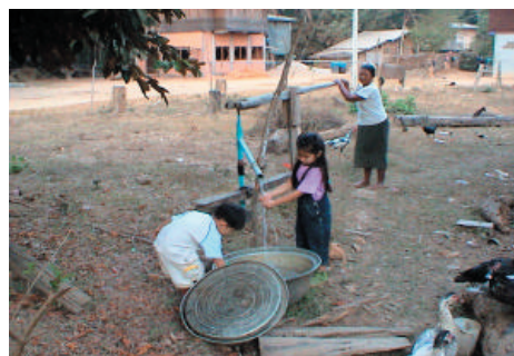
Figure 1. Children using a people's pump

In this backdrop, Nam Saat carried out a study on the