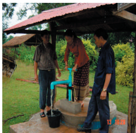
Figure 4. Modified people's pump

In July 2004, this newly developed model has been installed in Ban Keoku village (refer Figure 4) and Ban Phonekeo Primary School of Keoudom District of Vientiane Province. Both of these handpumps are at a pilot stage. If they work well, then Nam Saat will promote and assist villagers to install more of this type of handpump.