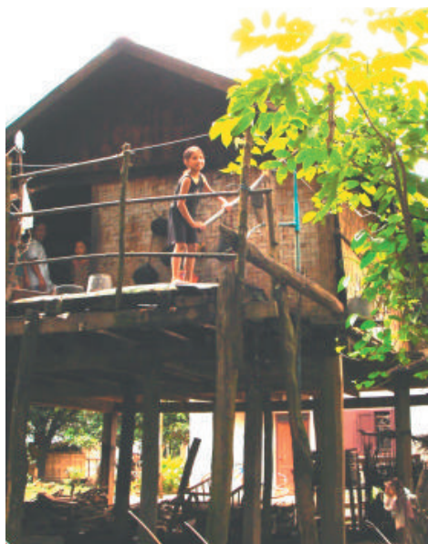
Figure 5. Showing the people's pump installed at the first floor of a house in Ban Had Pienkham village.

Pump at the first floor level of their house (see Figure 5). Also, another eight households have up-graded their People's Pump with electric motors. The current cost for installing a People's Pump in Ban Had Pienkham Village is around US$ 30. Technicians from Ban Had Pienkham Village are being hired by neighbouring villages to install People's Pumps, for which the technical charge is around US$ 20 per unit. The People's Pump has been successfully adopted and adapted by Ban Had Pienkham Village.