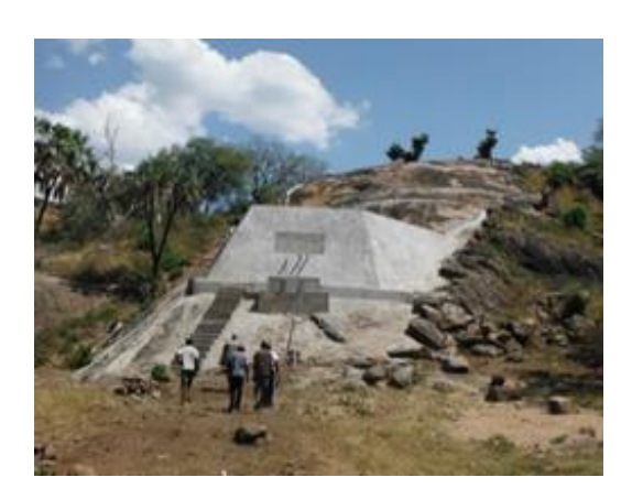
Photograph 1. Completed rock catchment system in Mohina. View from the tank.

The principle of a rock catchment system is relatively simple: The run-off water from the rock surface is channeled to the weir(s) by gutters, from where it goes to a filtration box (sand filter principle) before to be piped into closed storage tanks. With this system, water can be stored under safe conditions and is protected from contamination and evaporation. Ideally, the weir is connected to a sufficiently large storage to avoid water remaining in the open weir for long periods of time due to storage tank(s) being full. Open storage is not recommended due to high risk of pollution and huge evaporation losses. The tank(s) is connected to tap stands from where water can be fetched.