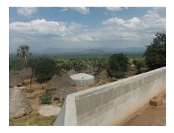
Photograph 2. Completed rock catchment system in Mohina. View from the weir.

The weir is also connected to a washout pipe as well as additional outlet pipes to allow for future connections to additional storage tanks.