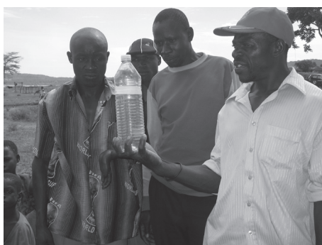
Photograph 1. Water committee members in Lwanika, Uganda, discussing the water quality

Providing some of this information to monitoring systems at district and national level, as well as to the implementing NGO and donors, has the relevance to interlink all involved parties with the operation and maintenance of the water system. Uganda is in a process of decentralisation where responsibility and authority is given to districts, but still needs time to institutionalise the changes. However, already now, sub-county and district levels are involved in these projects and receive all reports. Information feeds into the national plans to provide safe water to all rural growth centres, but substantial efforts are needed to properly coordinate these data for improving both the quality and quantity of water supplied.