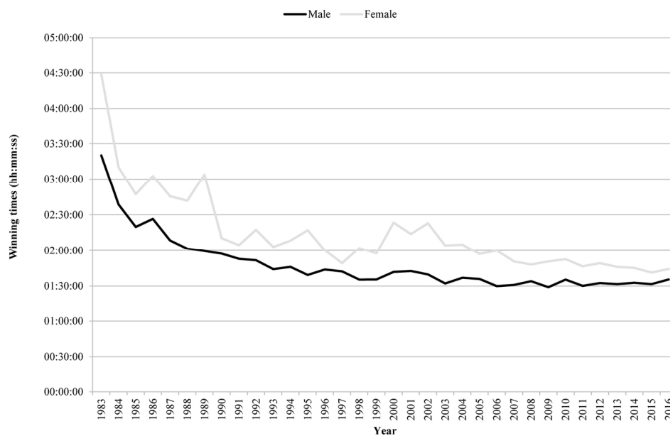
Figure 1 – Illustration of the winning times at the London marathon for the male and female events since 1983