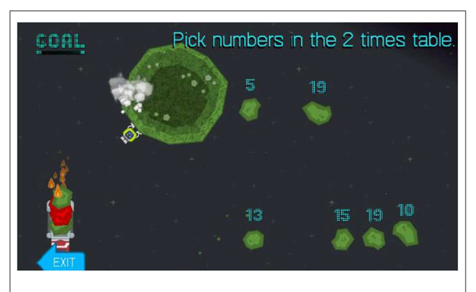
FIGURE 1 | Screenshot from RAIDING game, 2-times-table mini-game.

The game was designed around touch-screen controls on (7inch) tablet devices. It is set in outer space, and the aim is to collect and preserve alien life within the biodomes of a central mothership. The player controls a small flying robot, which can explore an area of space around its base in search of seeds and eggs to nurture in the biodomes. To support the mission, the player must earn credits to buy new components for their mothership, including biodomes, power sources and engines. These "building and collecting" mechanics fuel the economies of the game and motivate the player to continue playing. Fundamental to all of these activities is the "mining" mechanic which provides the player with credits, seeds and eggs. The player's robot must mine asteroids for resources that are converted into credits, but mining also provides the chance to find alien seeds and eggs within the asteroids. There are 100 different aliens to find in total, and each alien prefers a biodome with a particular combination of climate and plants. The inclusion of a variety of collectable elements within the game allowed for multiple reward schedules, including both linear and non-linear performance/reward contingencies; there