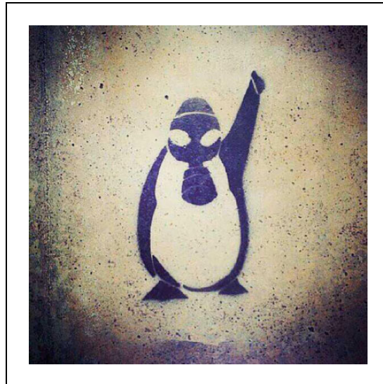
Figure 1. Stencil of a penguin wearing a gas mask. Street graffiti in Istanbul (or digital simulacra) widely circulated on social media.