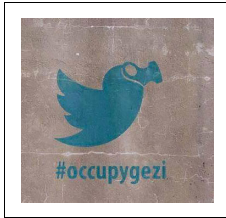
Figure 2. Twitter logo bird wearing a gas mask. Occupygezi hashtag. Digital artwork mimicking street graffiti widely circulated on social media.